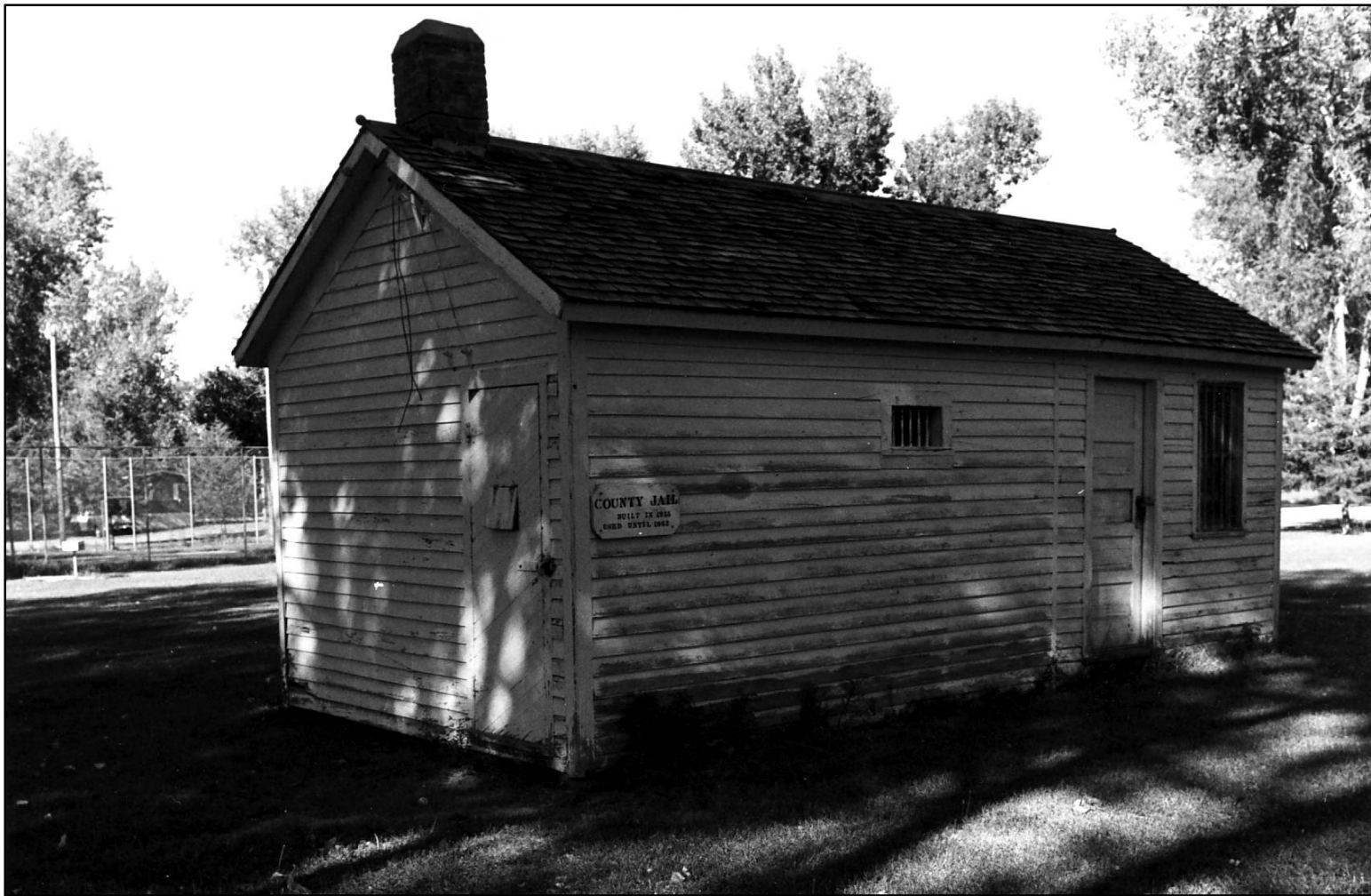
Photo 2 of 4 – Jail, looking NE showing S & W facades