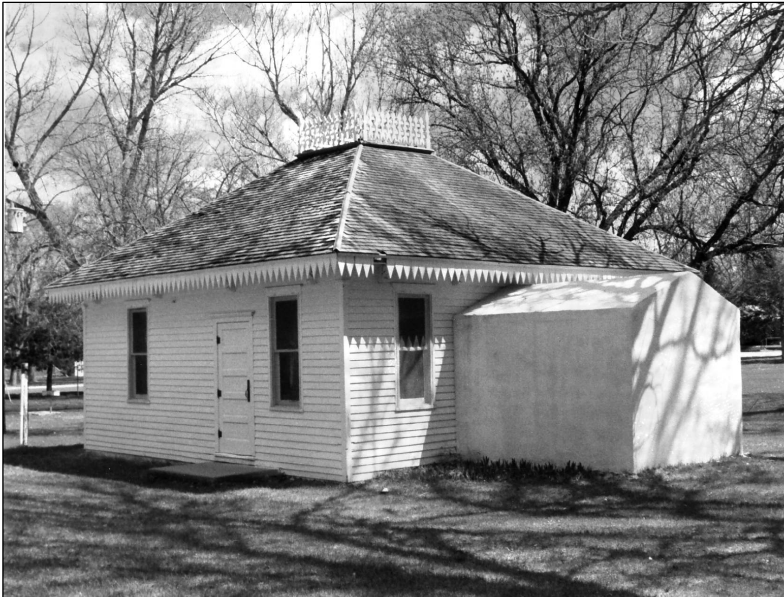
Photo 1 of 4 – Courthouse, looking NE showing W & S facades