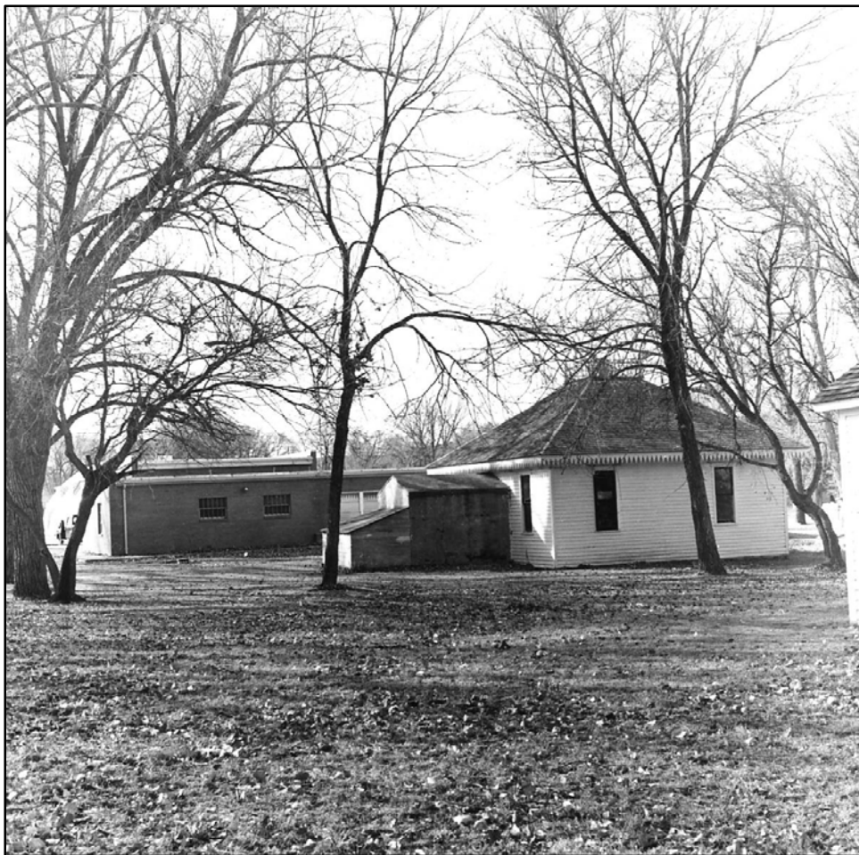
Photo 3 of 4 – looking west showing relationship of jail (at right), former courthouse & present courthouse (NSHS H673:5-25)