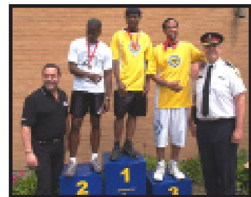
» WINNERS OF THE YOUTH CUP ROAD SERIES