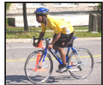
» STUDENT PARTICIPANT AND HIS NEW BIKE