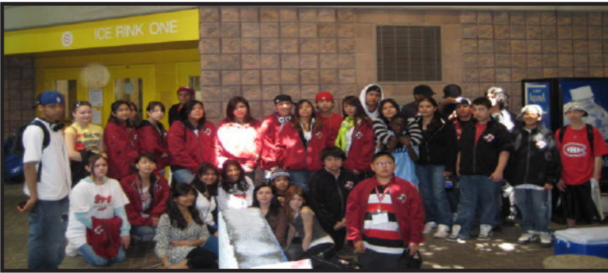
» EXCHANGE PARTICIPANTS FROM MANITOBA AND MALVERN GATHER INSIDE THE MALVERN RECREATION CENTRE