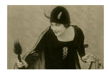
Lunedì 30 giugno 2014, 16.30