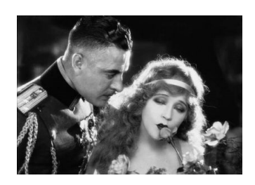
Martedì 1 luglio 2014, 21.45