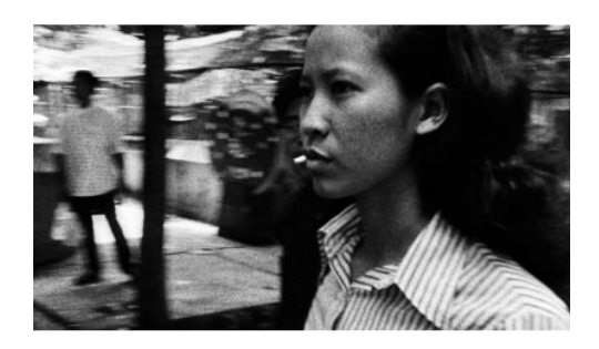
Sabato 5 luglio 2014, 18.15