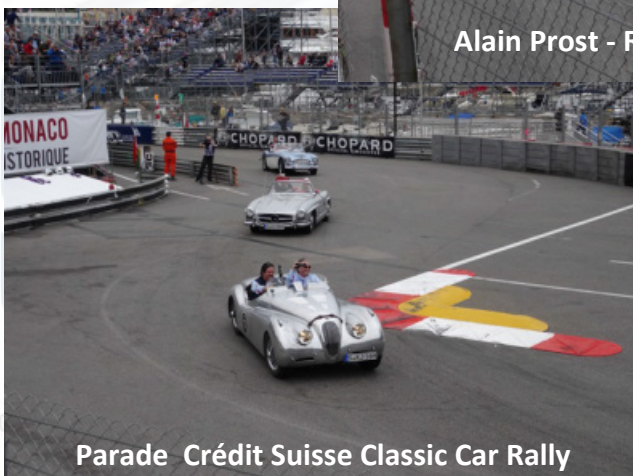
Parade Crédit Suisse Classic Car Rally