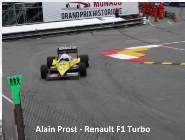
Alain Prost - Renault F1 Turbo