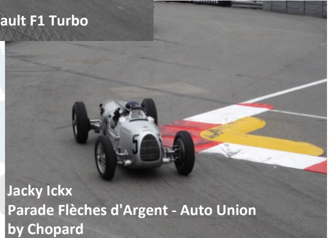
Jacky Ickx Parade Flèches d'Argent - Auto Union by Chopard