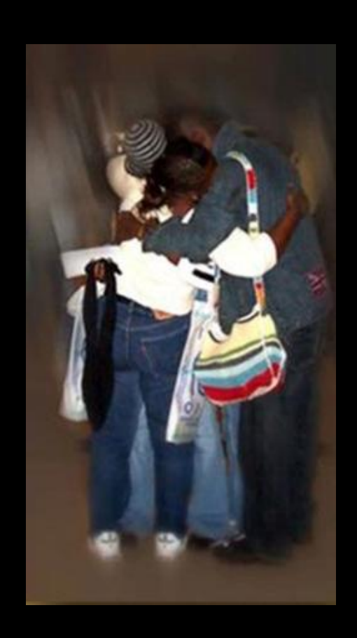
3<sup>rd</sup> Country Resettlement