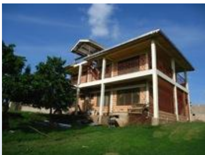
Side view of the rectory

Jema is the capital of the Kintampo South District, which was created and inaugurated on 24th August, 2004. It has an estimated population of about 7,868 while the total population of the District is 93,600 according to the figures released by the 2010 Population census of Ghana.