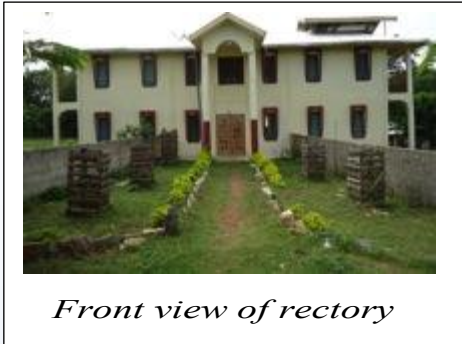
Front view of rectory

There are three Masses on Sundays: one at the main Parish station, the second at the local Senior High School and the third, at an outstation Chapel. The rest of the stations are visited on monthly basis.