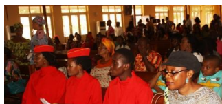
A section of parishioners at a liturgical function

In conclusion there was a group sharing and discussions. This exercise offered the participants some reflections and suggestions.