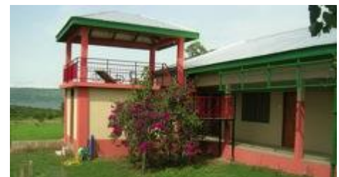
View of part of the rectory at Ekye