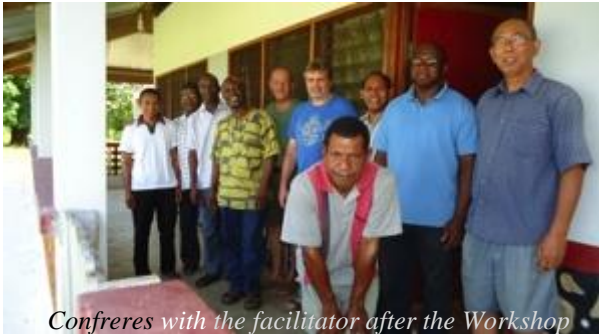
Confreres with the facilitator after the Workshop

Confreres who participated in the recent B/A District Communication workshop have all expressed their amazement at the many, seemingly new things they have rediscovered to sustain effective communication among themselves and with others. The workshop took place at our SVD B/A District House from the 6 th to the 7 th of May 2013.