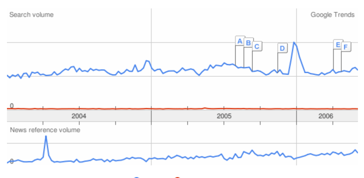
Ofucking O''making love''

Lest the Examiner believe that these queries are out of context, the Applicant provides the following – a comparison between "fucking" and "making love." See Exhibit J.