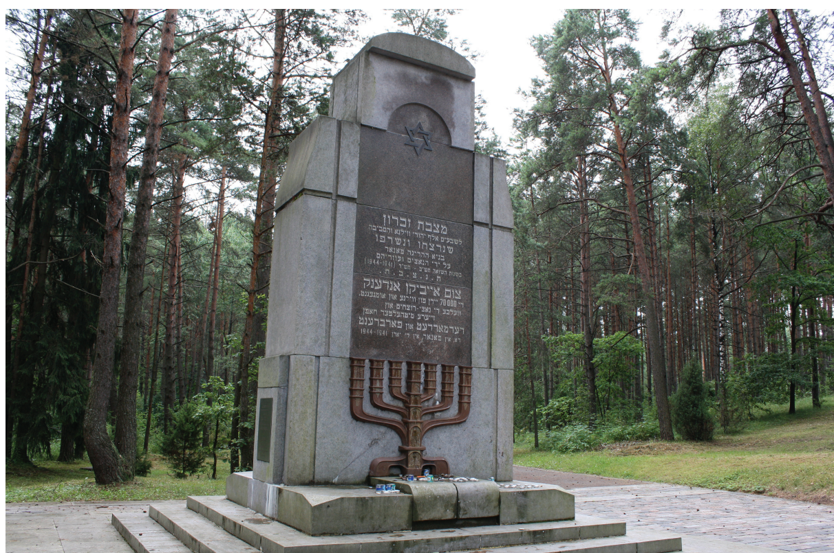
MONUMENT ERECTED at Paneriai to commemorate the 70,000 Jews killed at the site between 1941 and 1944.

WHILE UNDOUBTEDLY Lithuania suffered under the Communist regime – the Soviet occupation of the country in 1940 was so brutal that many welcomed the Nazis in 1941 and as the Soviet army reoccupied the country