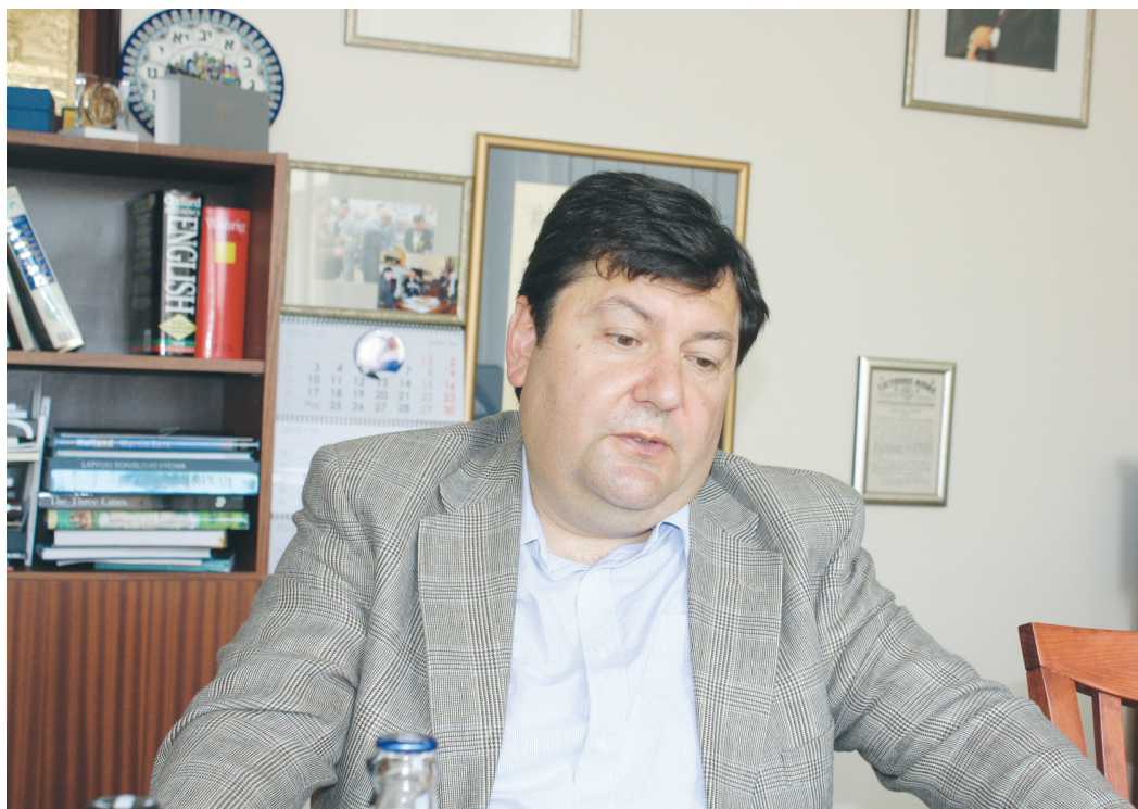
MP EMANUELIS ZINGERIS, chairman of the International Commission for the Evaluation of the Crimes of the Nazi and Soviet Occupation Regimes in Lithuania.

As chairman of the International Historical Commission for the Evaluation of the Crimes of the Nazi and Soviet Occupation, founded in 1998, Zingeris plays an important role in Holocaust education and research in Lithuania. The commission he heads is charged with publishing educational materials, research projects and other findings and founding “tolerance centers” in Lithuanian schools, of which there are now 67.