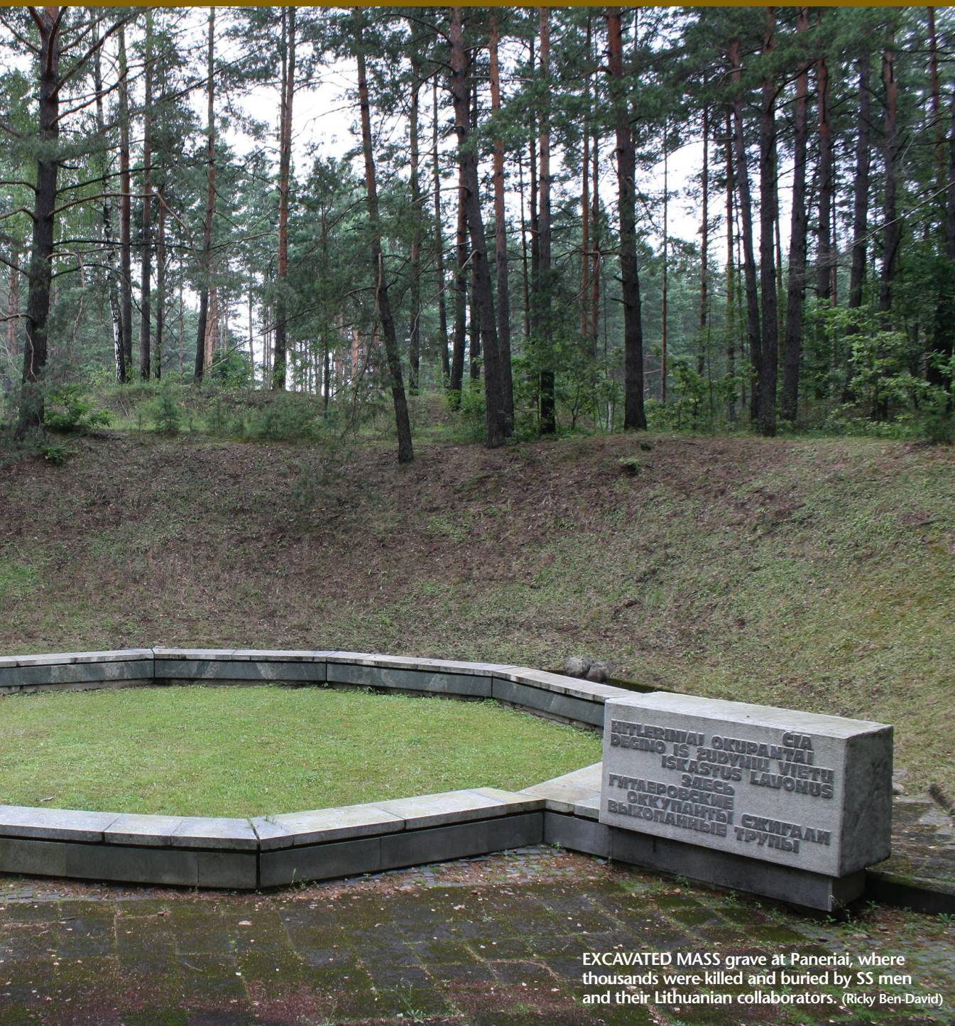
EXCAVATED MASS grave at Paneriai, where thousands were killed and buried by SS men and their Lithuanian collaborators.