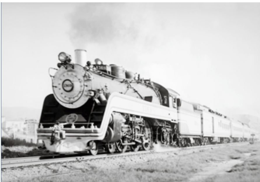
Pacific 1369 barrels through San Clemente with train 73 on November 5, 1940. Engines 1369 and 1376 and a heavyweight consist were painted silver with red, black, and yellow striping for the Bakersfield-Oakland Valley Flyer. After the Flyer came off, the colorful set moved to the Surf Line.

yard at San Diego, and tie up at the engine servicing facilities in National City. A yard switcher would sort the train for delivery to industries or interchange with SP's San Diego & Arizona Eastern.