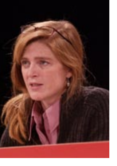
Samantha Power is the author of 'A Problem From Hell' for which she won the 2003 Pulitzer Prize for general non-fiction. She attended Conference 4.