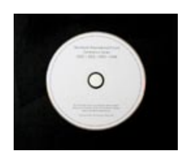
A full dokumentation of the four conferences comes on a CD with the book Beyond the 'Never Agains'.