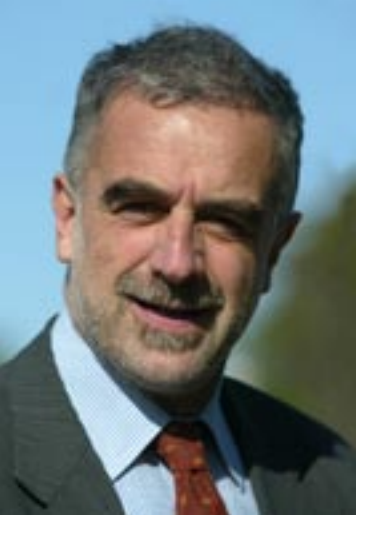
Luis Moreno Ocampo is the Chief Prosecutor of the International Criminal Court (ICC). He attended Conference 4.