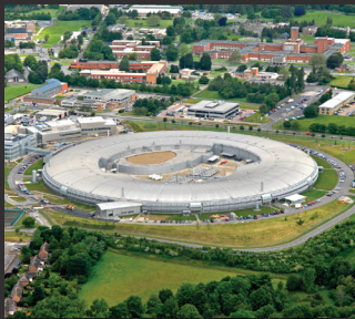
STFC Space Test Chamber The Diamond Light Source - Harwell, Oxford