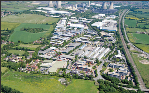
Milton Park, near Didcot

Twenty minutes from Oxford, with London and two major airports less than an hour away, The Science Vale UK Enterprise Zone is ideally positioned for local, national and international science and enterprise, and is a key part of Oxfordshire's high value economic infrastructure.