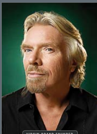
VIRGIN BRAND FOUNDER RICHARD BRANSON

Of course, the executives that Branson has hired to develop his global empire say success still comes down to filling a market need. That often means tweaking a business