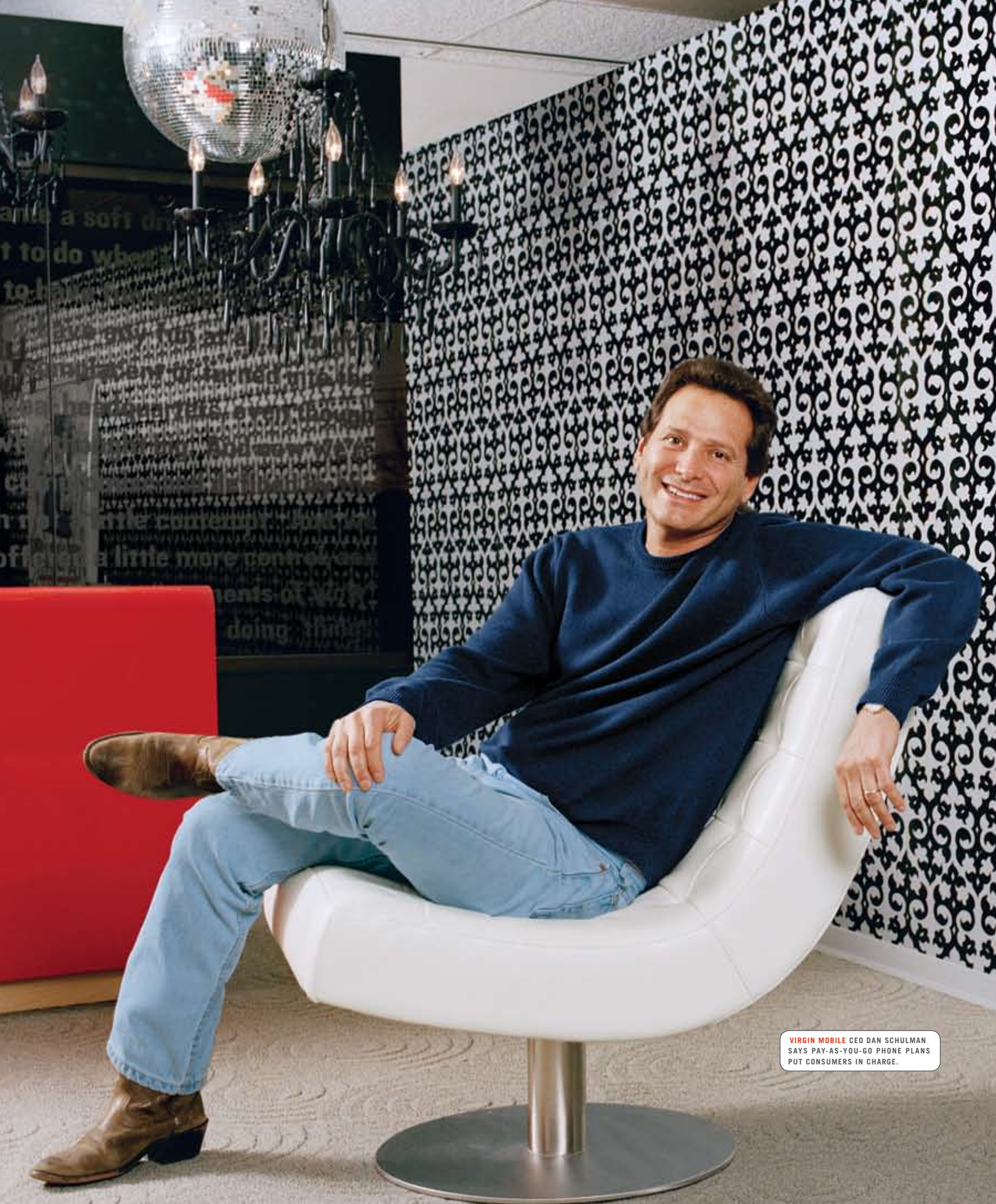
VIRGIN MOBILE CEO DAN SCHULMAN SAYS PAY-AS-YOU-GO PHONE PLANS PUT CONSUMERS IN CHARGE.