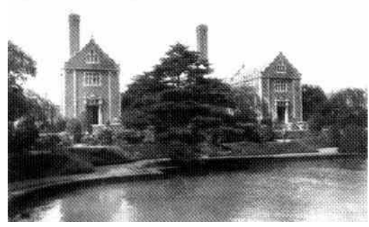
Bagthorpe Pumping Station – showing the ornamental cooling ponds. Now demolished.

In 1857 Hawksley built the Bagthorpe Works (3) which stood on the corner of Hucknall Road and Haydn Road. Steam powered beam engines powered the pumps, which operated until the early 1960s when replaced by electric pumps. One of the engines was rebuilt at the Wollaton Park Industrial Museum (10) see places to visit.