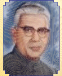
Founder J.S.P.M. Late Shri Vasantaoji Naik Ex. Chief Minister, Maharashtra State