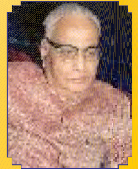
Founder Secretary Late Shri Sudhakarrao Naik Ex. Chief Minister, Maharashtra State & Ex-Governor, Himachal Pradesh