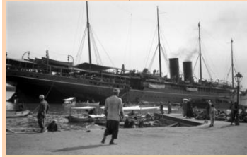
"Caledonia" coaling at Port Said 1914.

/ m.17.1.1880 Assam, India (1st cousin); Emily Frances Anne de Courcy (K 18); b.16.3.1853 Calcutta, India