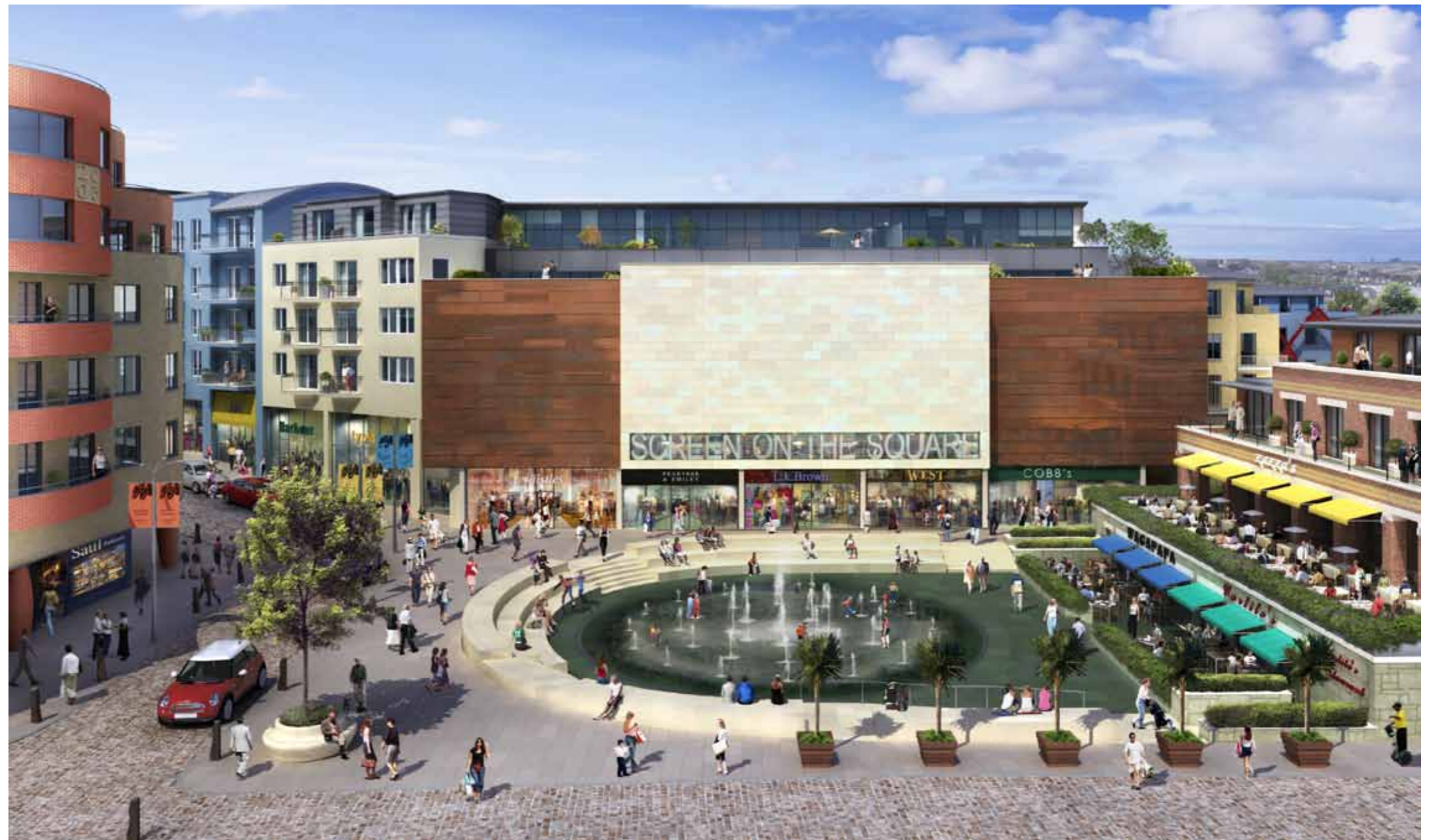
Bottom: View from the square towards the new station