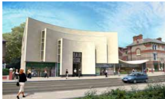
Above The new Health centre