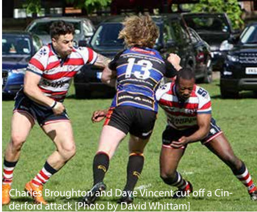
Thursday 8th May