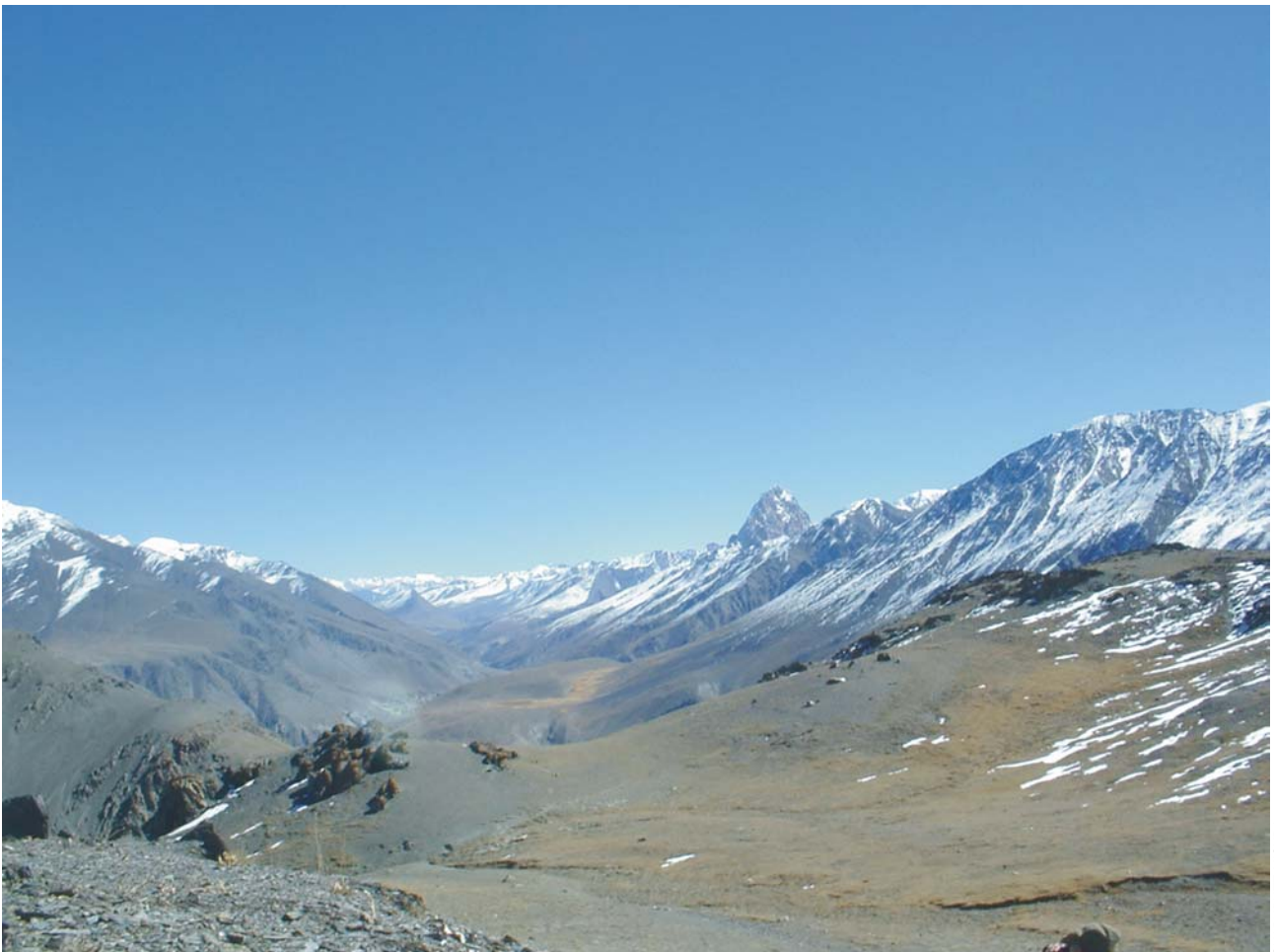
Top of Dalriz pass

Overnight Sarhad c/o Kachi Beg (telefon). Fine clear night.