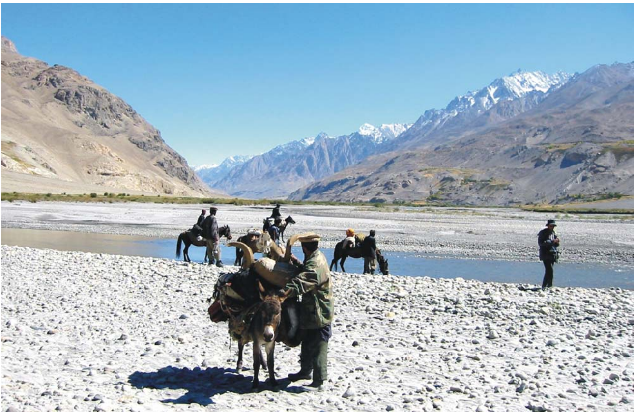
Ghaz Khan region

Overnight-Camp at Jangal-e-Gurvash in riverine scrub by the Pamir River.