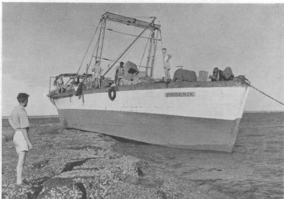
PLATE 2A. Phoenix on a reef at Boucaut Bay