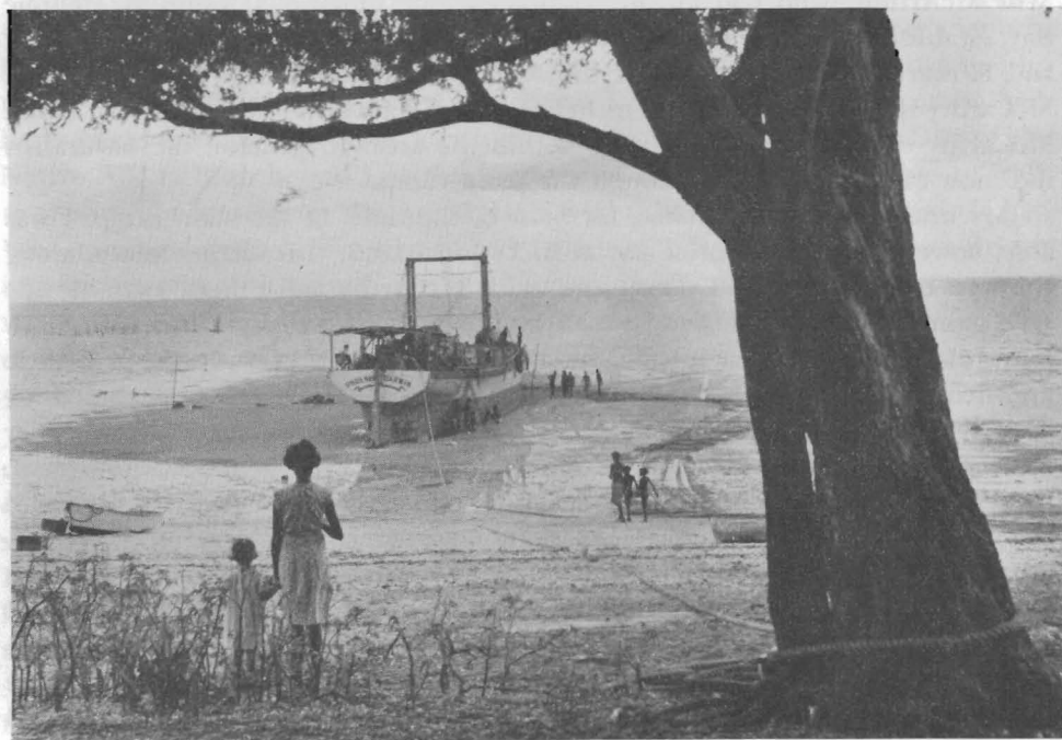
PLATE 2B. Phoenix unloading at Milingimbi