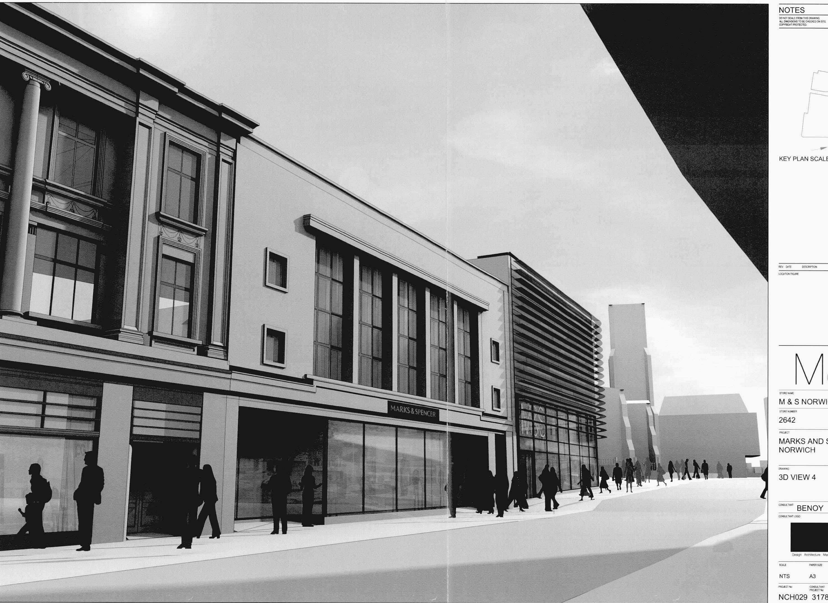
KEY PLAN SCALE 1:1250