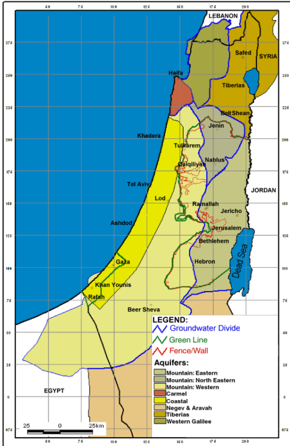
Map 1: Aquifers in Israel and the Occupied Palestinian Territories