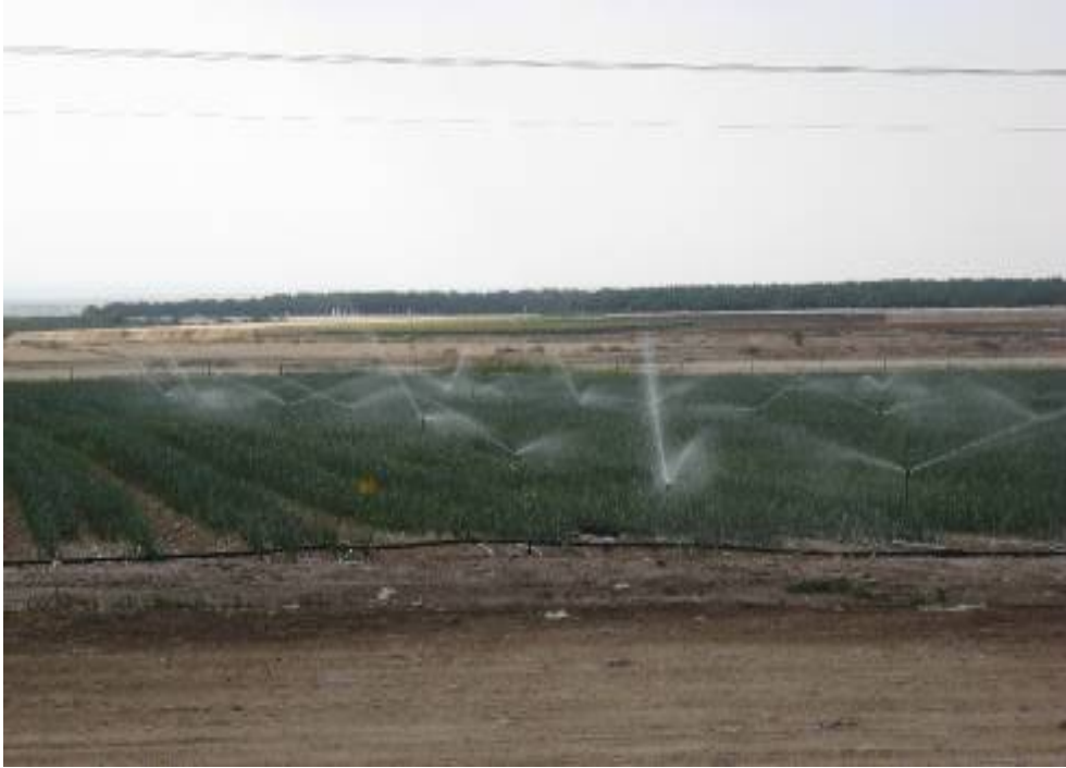
Sprinklers in Israeli settlement farms in the Jordan Valley, West Bank

The nearby Israeli settlement of Shadmot Mechola advertises on its website: “Breathtaking tours to Amaryllis bulbs hot houses which are harvested, packed and shipped to Europe and USA and potted in time to bloom during the winter holiday season. Short tours of our “Hi-tec” dairy farm, vineyards and orchards. Tours of farms in the Jordan Valley who specialize in crops of vegetables, fruits, flowers and spices for export in hot dry climate.” 9