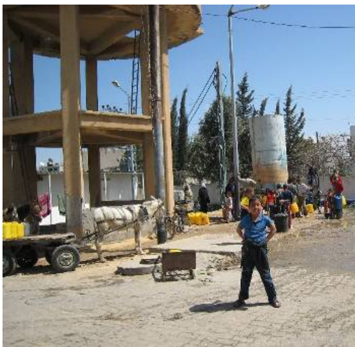
Residents filling containers of drinking water at a water purification plant in Khan Yunis, Gaza Strip

The yearly sustainable yield of the Coastal Aquifer in Gaza, some 55 MCM, falls far short of the population's needs. Israel does not allow the transfer of water from the Mountain Aquifer in the West Bank to Gaza. (In any case, such transfers would be feasible only if Israel allowed the Palestinian population of the West Bank access to a more equitable share of the Mountain Aquifer, as the current allocation is not sufficient to meet even their own needs.)