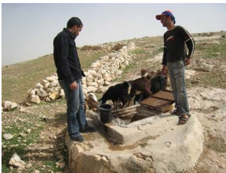
A Nabataean cistern belonging to Hathaleen shepherds in the Southern Hebron Hills

Rainwater harvesting cisterns have been used in the region for centuries. Household cisterns are mostly small, with an average capacity of 50m 3 . Agricultural cisterns, with a slightly larger capacity, are built in the ancient Nabataean tradition - located at the lowest point of a specially contoured area that is created with slopes and berms to increase rain run-off and collect the rainwater. The cisterns are circular or square, dug into the ground and lined with stones or concrete to prevent leakages, with an opening at the top that is kept covered to prevent evaporation and contamination. The water collected during the rainy season is stored for use in the dry season.