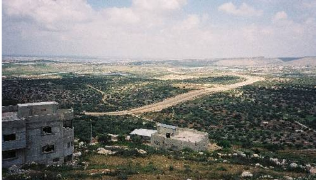
Jayyus' land with the fence/wall snaking through the landscape

An examination of the map showing the line of the fence/wall around Jayyus indicates that its route was determined with land grabbing, rather than “security” considerations, in mind. The fence/wall makes a large loop around the Israeli settlement of Tzufim, itself built on Palestinian land, incorporating an area of Palestinian land ten times the size of the settlement, with a view to expanding the settlement in the future. 110