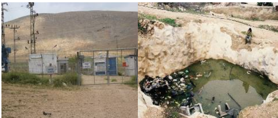
Left: An Israeli well in the OPT

The Israeli authorities, meanwhile, not only determine the quantity of water that the Palestinians are allowed to extract from the Mountain Aquifer but also monitor and enforce Palestinian compliance and control even the small quantities of rainwater that Palestinian villagers collect to augment the inadequate supplies available to them. The Israeli army frequently destroys small rainwater harvesting cisterns built by Palestinian communities who have no access to running water.