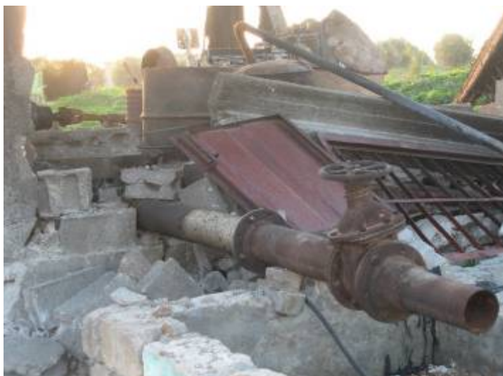
A water pump and well in the Zaytoun neighbourhood of Gaza City destroyed in an Israeli attack in January 2009

additional water locally. 71 Consequently, the only way to try and meet the population's water needs has been through over-extraction from the aquifer at a rate more than double its sustainable yearly recharge. Unsurprisingly, this has caused rapid deterioration of the aquifer, increasing its salinity and making it ever more vulnerable to contamination from sewage infiltration.