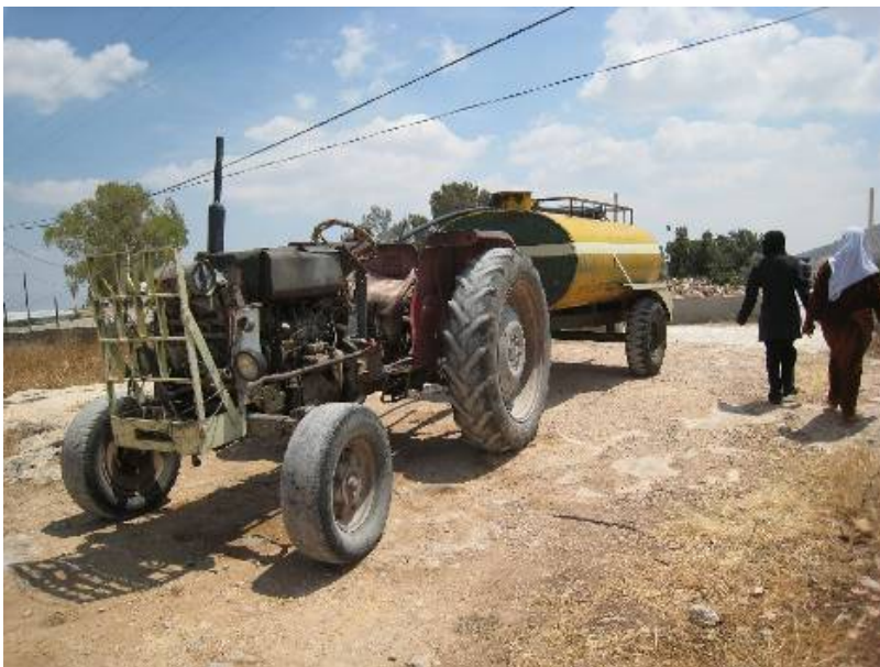
A tractor used to pull a water tanker in al-‘Aqaba village in the West Bank

Iman Jabar, a resident of al-‘Aqaba village, whose home has a demolition order pending against it, told Amnesty International, “ There is no water in the village, so we have to bring it from far away and it’s expensive. I have nine children (five girls and four boys aged from five to 19 years). We spend a lot of money on water and we have to make do with very little, just for drinking and cooking and don’t have enough for the other needs. We need more water for washing, washing the clothes and cleaning the house. I can’t wash and clean as often as needed. We can’t afford it. It’s a daily struggle. The goats also need to drink. We can’t keep more goats because we can’t afford the water, and we can’t grow food for us and fodder for the animals, so we have to buy it and this too is expensive. ”