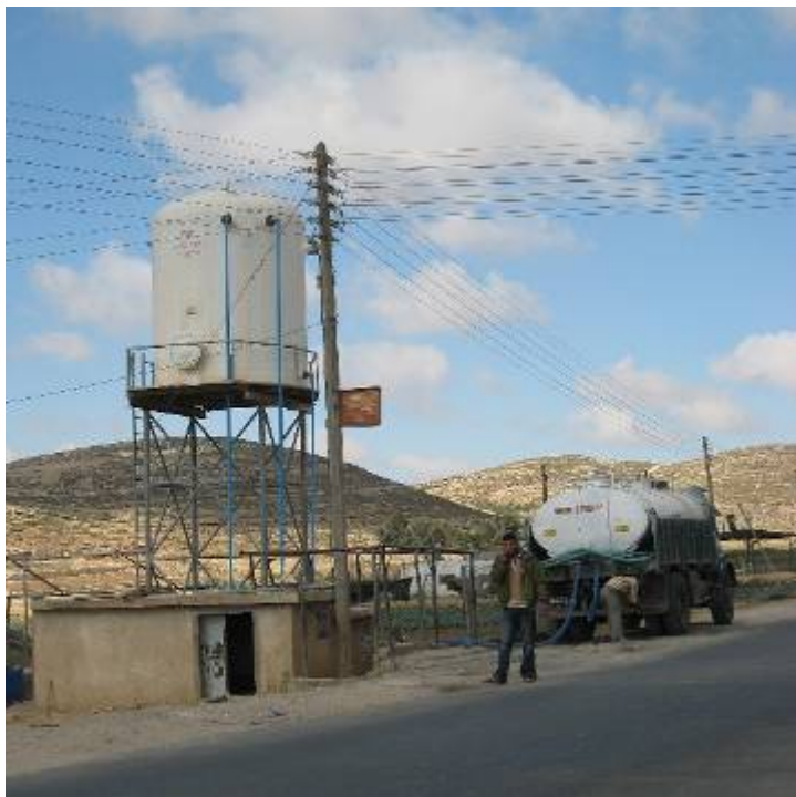
A water tanker at a filling point in Rihiyeh, in the southern West Bank

the water has to be delivered by a smaller tanker or by small tankers attached to tractors. This requires more trips and each trip is several times longer than it would be if the roads were open. So, we spend more time and consume more fuel. As well, the vehicles break down all the time because of the bad roads and often the army sets up flying checkpoints and these cause further delays.