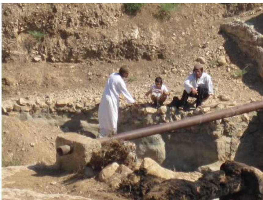
Settlers bathe in a watering spot for Palestinian livestock and harass shepherds who approach it in Ein al-Hilwe, West Bank

Israeli settlers frequently carry out attacks against Palestinians and their property in the West Bank, including causing damage to their water facilities, yet the Israeli authorities rarely investigate such attacks and those responsible generally enjoy impunity. Indeed, settler attacks on Palestinians or their property have often been perpetrated in the presence or with the knowledge or tacit consent of Israeli soldiers, and in some cases with their active participation. Even when physical injuries or deaths have occurred, settler attacks have usually gone unpunished. 148 Israeli settlers, unlike Palestinians in the West Bank, are not subject to Israeli military law and the army, though usually present near settlements, does not arrest settlers; rather, the soldiers have often made it clear that their task is to protect the settlers, not Palestinians. Palestinians may complain to the Israeli police, but their complaints are rarely followed up and many Palestinians do not report settler attacks for fear of retaliation. International human rights activists, including Amnesty International delegates, have been physically assaulted by Israeli settlers while investigating or documenting settlers' attacks. 149