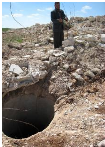
Destroyed cisterns and orchards in Beit Ula

An Amnesty International delegate who visited the area on 15 March 2008 found that everything had been destroyed – apart, that is, from a plaque on which it was written: “European Union - Palestinian Agricultural Relief Committees - Project 2005/106-391.” The cisterns had been systematically smashed and with the exception of a few saplings the orchard trees had been uprooted and destroyed. Bulldozers had been used to churn up the land, the fencing around the fields had been torn down and even old olive trees, planted many years before, had been uprooted and crushed. It was a scene of devastation.