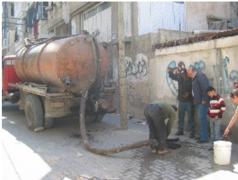
Cesspit being emptied in Gaza

The pollution of the Mountain Aquifer is a subject of contention with the Israeli and Palestinian sides each accusing the other of causing it. In practice, both sides have failed to comply with their obligations and they have both failed to take adequate measures to stop and reverse the damage.