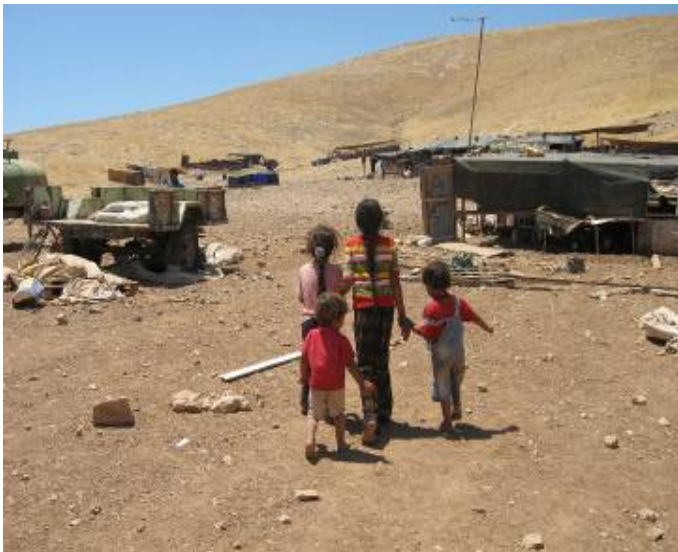
Children in Humsa

In'am Bisharat, a mother of seven children who lives in Hadidiya, told Amnesty International: "We live in the harshest conditions, without water, electricity or any services. The lack of water is the biggest problem. The men spend most of the day going to get water and they can't always bring it. But we have no choice. We need a little bit of water to survive and to keep the sheep alive. Without water there is no life. The [Israeli] army has cut us off from everywhere. The roads are closed. The road to Tammun, where the children go to school, is only opened three days a week (Sunday, Tuesday and Thursday) and only for half an hour in the morning and half an hour in the afternoon (8 to 8.30am, and 3 to 3.30pm). So the children have to stay in Tammun with our relatives during the week. We don't choose to live like this; we would also like to have beautiful homes and gardens and farms, but these privileges are only for the Israeli settlers and we are not even allowed basic services."