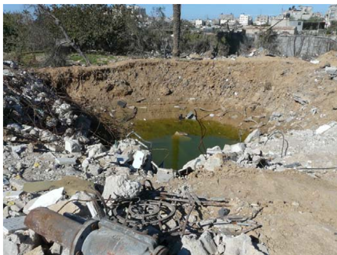
Sewage mains in northern Gaza destroyed by Israeli air strikes in December 2008/January 2009

Israeli forces have also damaged water facilities when demolishing Palestinian houses and property, often using D9 armoured bulldozers to dig up roads and rip through water and sewage pipes. These bulldozers have claw-like rippers which are attached at the rear and thus not of use in detecting or protecting the bulldozer operators against hidden explosive devices. These are used to dig up the road or terrain behind the bulldozers as they drive forward and are clearly intended to cause serious damage to roads and anything else in the bulldozers' wake.