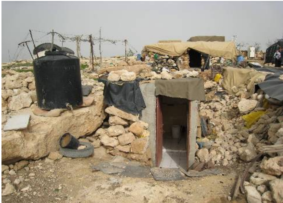
Susya toilet under demolition order by the Israeli army

On 3 July 2001, the Israeli army destroyed dozens of homes and water facilities in Susya and several other Palestinian villages nearby. 1 The army smashed the villagers' rainwater harvesting cisterns, some of them centuries old, with bulldozers and filled them with gravel and cement to prevent their repair. The soldiers also smashed water heating solar panels that had been provided to the villagers by a non-governmental organization. Some water cisterns were left undestroyed but they, together with the tents and shacks that now serve as the villagers' homes, and even the one toilet which they have built, all have demolition orders pending.