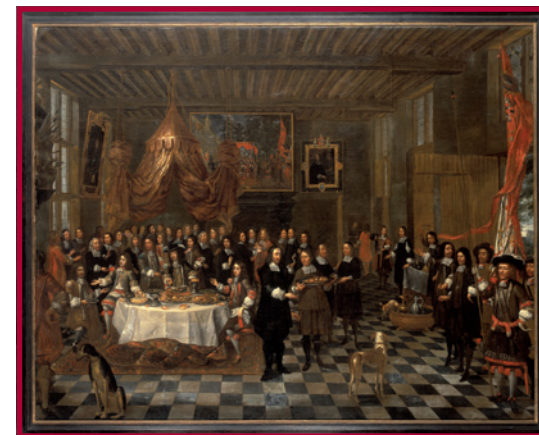
King Charles II at the St-Sebastiaen's Guild in Bruges