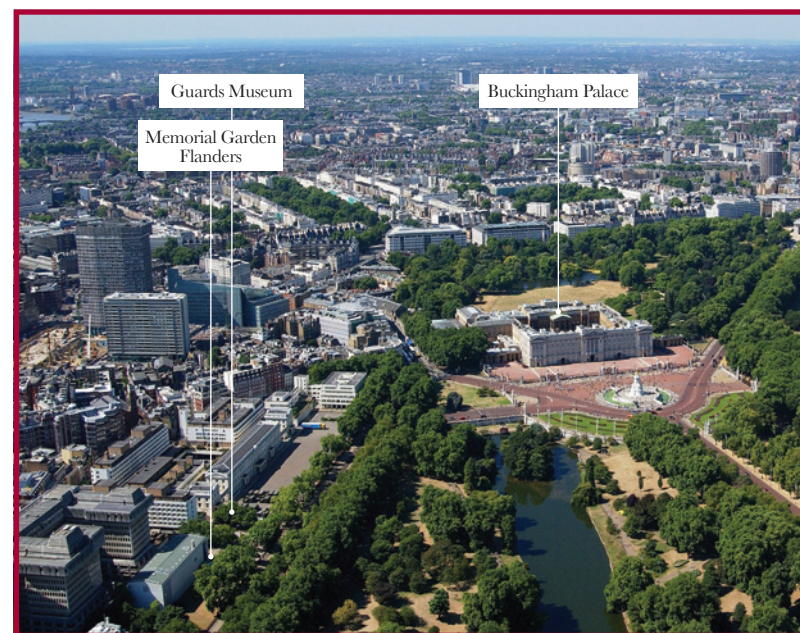
Map of the area

The Garden will be opened on 8 November 2014 in a unique and moving ceremony which will be attended by both countries’ Royal Families.