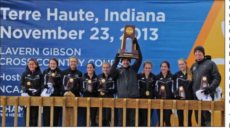
Providence College • 2013 NCAA Cross Country Champions

Along with the Bluejays and Friars, Villanova and Xavier earned NCAA Men's Basketball Tournament bids, while on the women's side, BIG EAST Tournament and regular-season champion DePaul punched its NCAA ticket, along with runnerup St. John's. The BIG EAST Women's Basketball Tournament was held for the first time at Allstate Arena in Rosemont, Ill., as the Blue Demons claimed their first tourney title in league history in front of a hometown crowd.