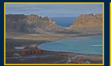
Overview of Whalers Bay visitor site with Neptunes Window in the background

Beware of hazardous substances. Materials containing asbestos may be present at the site.