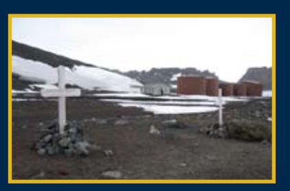
Details from the cemetery in front, and remains of hunting lodge and fuel tanks in the back.