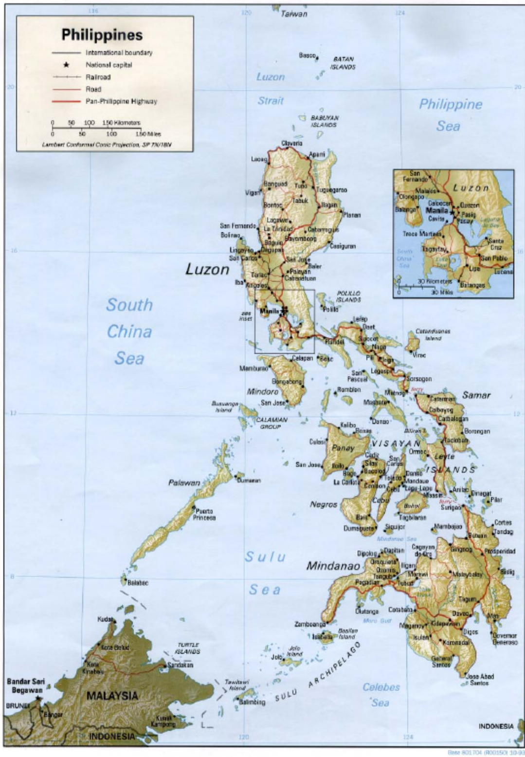
Figure 2. Map of the Philippines