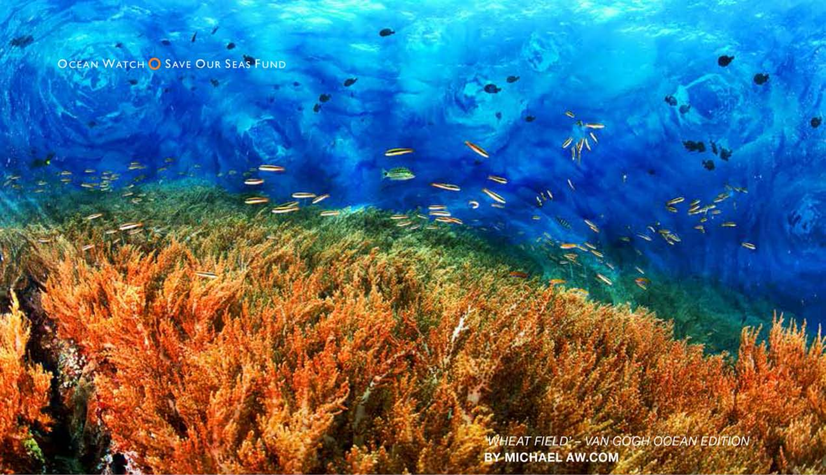
'WHEAT FIELD' - VAN GOGH OCEAN EDITION