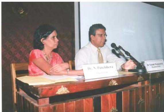
The President/SLMA addressing the gathering Seminar on “Dengue Hemorrhagic Fever”

15 th August 2010, at 8.30 a.m. at the Lionel Memorial Auditorium