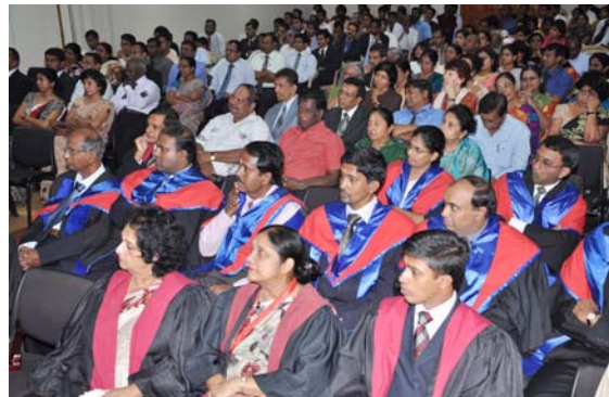
The distinguished gathering