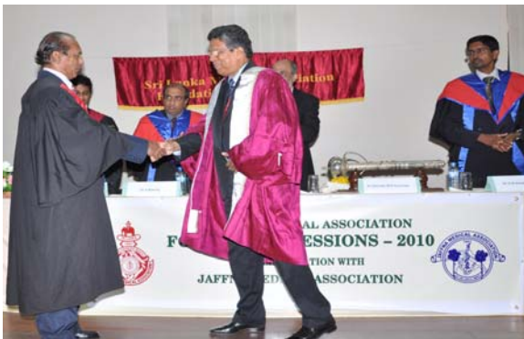
Award of Honorary Life Membership