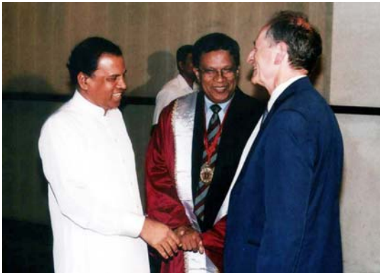
Welcoming the Chief Guest and the Guest of Honour