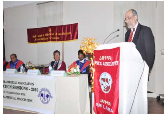
Address by the Chief Guest