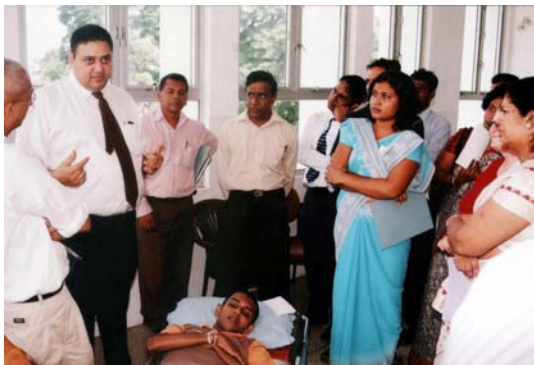
Post congress session on Rehabilitation