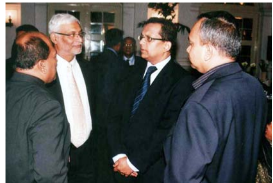
Fellowship at the conference dinner