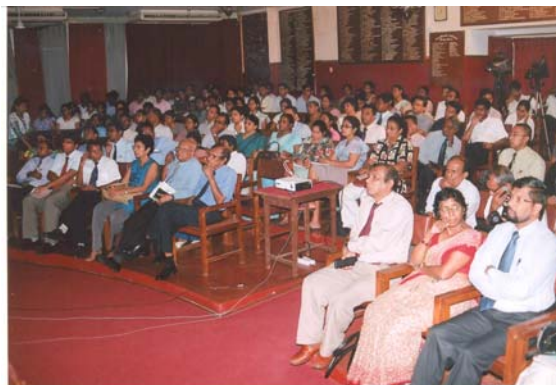
A section of the crowd