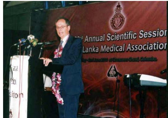
Address by the Chief Guest