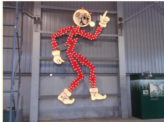
Reddy is ready!