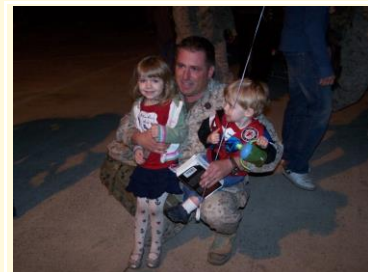
Support our troops by donating items for care packages.

The York County Heritage Trust will be collecting items to send to troops serving overseas in the lobby of the Historical Society Museum and the Agricultural and Industrial Museum from November 23-December 14. SOAR (Supporting Our American Recruits) will be collecting donations, packaging them, and sending them to service members. Please support our troops by donating items that can be found on this list .