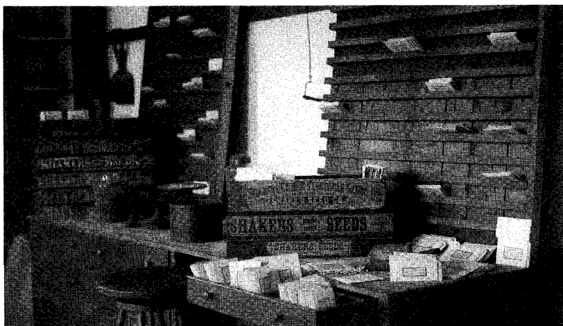
Fig. 2. The interior of a seed processing room at Pleasant Hill Shaker Village in Kentucky. Pleasant Hill is now operated as an open-air museum.

Early offerings of seeds were limited, but, as sales increased, many varieties were added to the seed lists. New Lebanon records indicate that the best-selling seed in the late 1700s to early 1800s was onion. Seedsman Artemas Markham lists 201 lb of onion seed produced and sold in 1795. Other vegetable varieties sold in that first year included scarcity beet (a fodder beet, also known as mangel-wurzel), carrot, cucumber, and summer squash. In that year, a combined total of 44 lb of these varieties was sold, with an income listed at $406 (Andrews and Andrews, 1974). The next year, records indicate that two varieties of turnip and three of cabbage were added to this list. By 1800, income from sales of seeds other than onion at New Lebanon had more than doubled to $1000. A number of societies joined the early producers in the first years of the 19th century. By 1820, nearly all the Shaker societies were producing seed for sale. Records show that at least 16 of the 18 long-lived societies had seed-production enterprises (Beale and Boswell, 1991; Sommer, 1972).