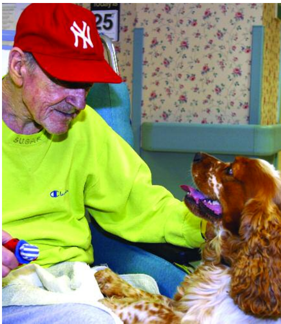
Therapy dogs have become a common sight in nursing homes and assisted-living facilities.

also required considerable time and attention, and they extracted an emotional toll."