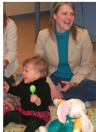
Mom and baby enjoy the games at the Captain William Spry Library (right); Sydney's McConnell Library with 119 children, parents, and caregivers attending this year (above); Siblings reading together at the Elmsdale Library, Colchester-East Hants (above right).