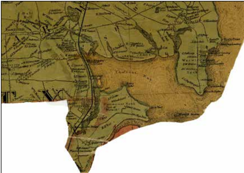
Figure 1: "Cowesett" or Greenwich Bay, with Potowomut on the south, Cowesett on the west, and Warwick Neck on the north and east. (1862)