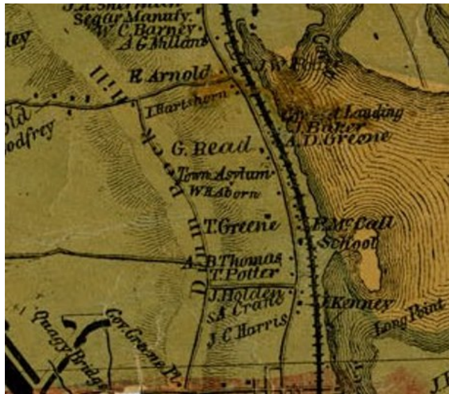
Figure 3: Eastern Cowesett in 1862 (detail).