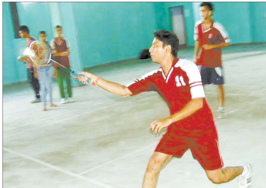
NL Correspondent Jammu | Sept. | 30