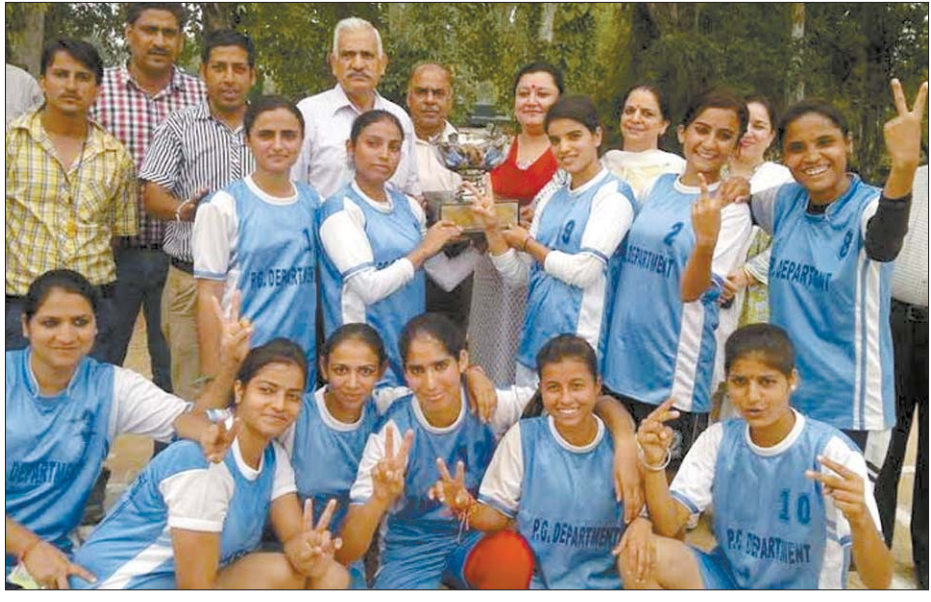
Jammu | Sept | 30

The combined side of Post Graduate (PG) Departments today clinched the women's title trophy in the ongoing inter-college kho-kho competitions held under the banner of Department of Sports and Physical Education, University of Jammu on the campus grounds, here.