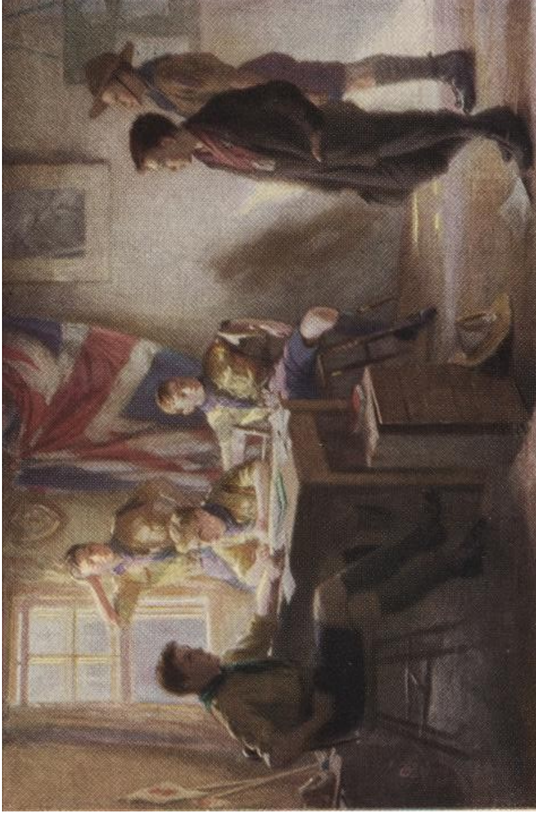
Carlos, Ernest Stafford Raw Material, 1914