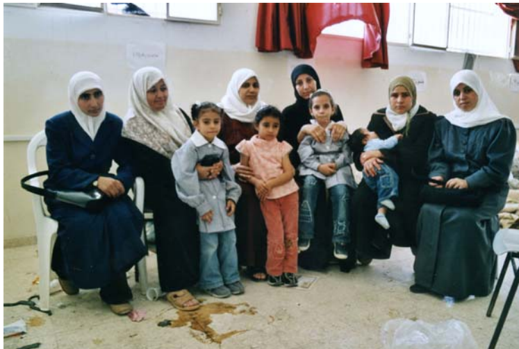
These women and children were made homeless when the Israeli army destroyed a seven-storey apartment building in Nablus on 5 September 2003. After the destruction they had to move in with relatives.

so after dark; how can we know who comes in and out of the building? It was a big building. We had saved for 14 years to buy this apartment; it was fully equipped and we had lived in it less than a year. Now we have nothing, all our furniture, clothes, documents, money, the children's school bags, our photographs, everything got buried in the rubble. The children have been traumatized by what happened, they saw their home destroyed, and every day they see the rubble of their home and don't have a