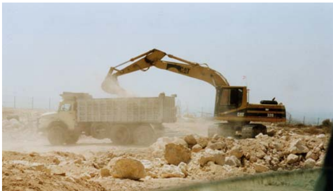
A US-made Caterpillar bulldozer is destroying land to build the fence/wall near Ras Atiya, West Bank .

depths. To date less than half of the route has been completed, mostly in the northern regions of the West Bank and around Jerusalem. In addition to the large areas of particularly fertile Palestinian farmland that have been destroyed, other larger areas have been cut off from the rest of the West Bank by the fence/wall. According to the Israeli authorities the fence/wall is intended to block entry into Israel to Palestinian suicide bombers and other potential attackers. However, the fence/wall is not being built between Israel and the Occupied Territories but