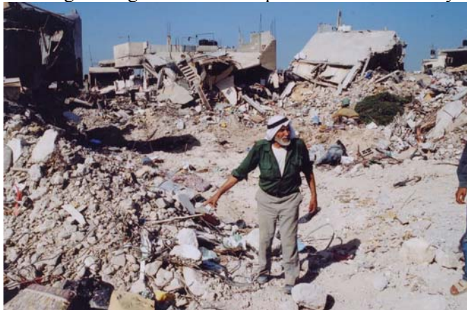
Man pointing at the rubble of his destroyed house in Jenin refugee camp, April 2002.

The largest single demolition operation carried out by the Israeli army was in Jenin refugee camp in April 2002. The army completely destroyed the al-Hawashin quarter, an area of 400 x 500 meters, and partially destroyed two additional quarters of the refugee camp, leaving more than 800 families, totaling some 4000 persons, homeless. 17 In the course of this and other Israeli army offensives there was considerable armed resistance by Palestinians, and the Israeli authorities claimed that the army destroyed the area in the course of combat with Palestinian gunmen. However the evidence, including