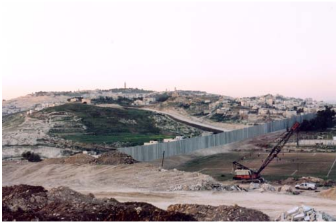
Construction of the concrete wall in Abu Dis, East Jerusalem, March 2004.

depths. To date less than half of the route has been completed, mostly in the northern regions of the West Bank and around Jerusalem. In addition to the large areas of particularly fertile Palestinian farmland that have been destroyed, other larger areas have been cut off from the rest of the West Bank by the fence/wall. According to the Israeli authorities the fence/wall is intended to block entry into Israel to Palestinian suicide bombers and other potential attackers. However, the fence/wall is not being built between Israel and the Occupied Territories but