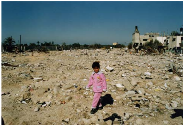
House demolition in Rafah, near the border with Egypt. ©AI, February 2002

The already poor sewage system was further damaged by the Israeli army tanks and bulldozers, along with water mains and electricity and telephone lines. The Israeli army stated that during the operation it had uncovered three tunnels used by Palestinian armed groups to smuggle weapons from Egypt to the Gaza Strip. 25 In the preceding six weeks some 50 other houses were also demolished in Rafah, leaving hundreds more Palestinians homeless.