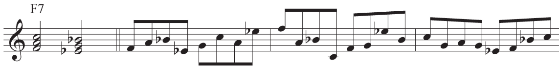
Example 6. Double Mambo : random line using the pitches from the F and Eb major triads.

based on a mixture of the Eb and F major triads over the F7 chord: