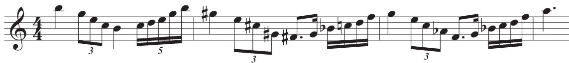
Example 11. Last four measures from Henderson’s “Inner Urge.”