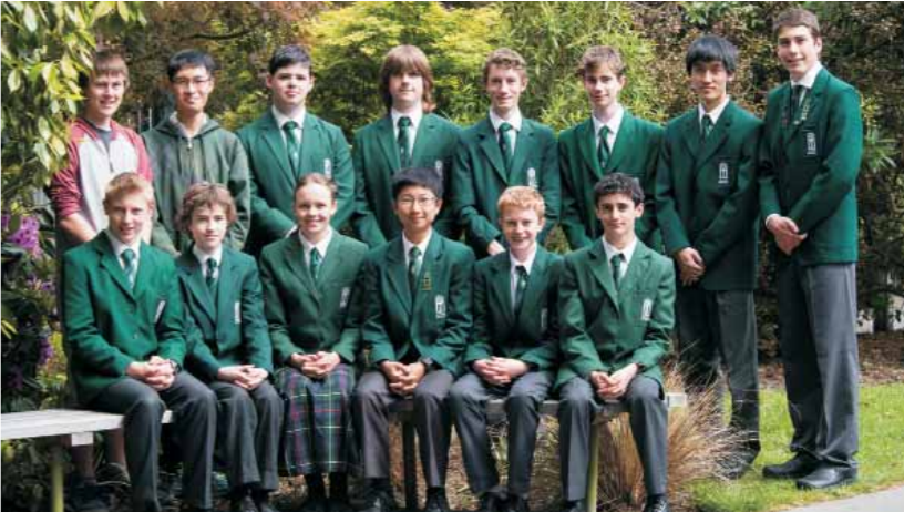
Excellence in Digital Technologies

At Burnside High School students are taught to strive for Excellence, not just an Achieved grade. This is evident in the statistics from 2013 NCEA results where a high number of our students have received a merit or excellence endorsement.