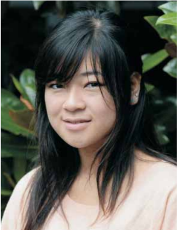
Top student in New Zealand for Japanese

focus on achievement and success in academic programmes