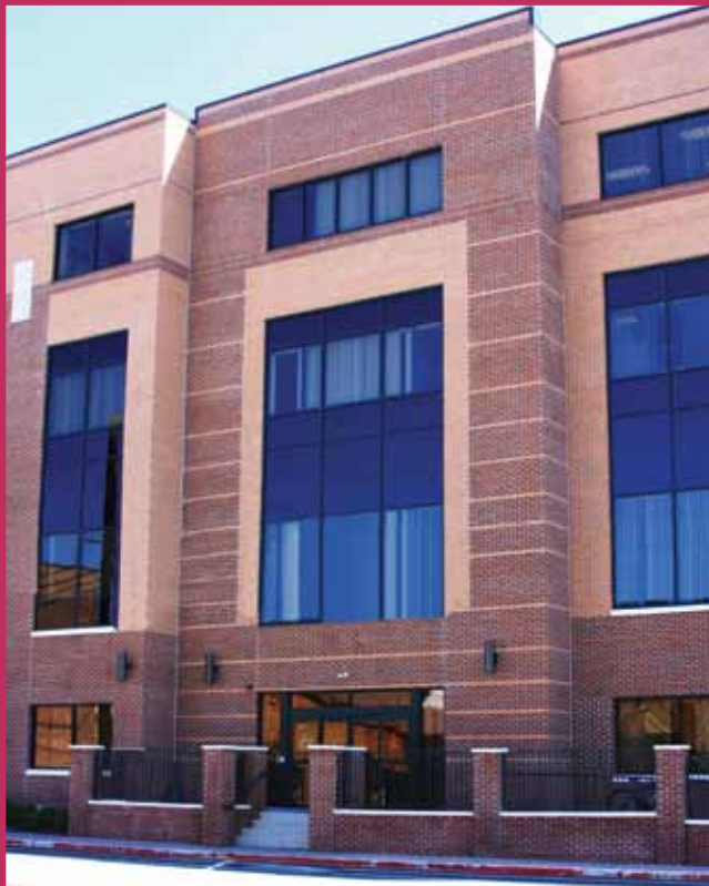
Somerset Executive County Superintendent of Schools 27 Warren Street, Somerville