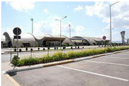
Sulaymaniyah International Airport

The city is dependent on road transport. On 20 July 2005 Sulaimaniyah International Airport opened, with regular flights to various eastern and European destinations such as Ankara, Frankfurt, Stockholm, Malmö, Munich, Eindhoven and Düsseldorf as well as Middle Eastern cities like Dubai, Amman, Beirut, Damascus and Istanbul.