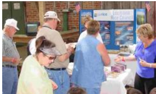
Festival attendees visit the Louisiana Rice Council / USA Rice Federation booth at the Rice and Gravy Cook-off at Acadian Village.

During the event, 38 teams competed to cook the most delicious beef gravy to serve over Louisiana-grown rice. Falcon Rice Mill of Crowley furnished the rice and the Louisiana Beef Council provided 850 pounds of beef for the contest.