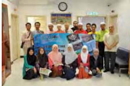
Students from Malaysia