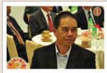
文萊副總領事Moksini Puteh先生