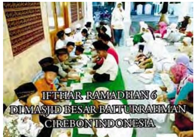
Iftar in Indonesia