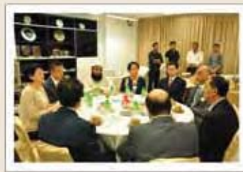
入境事務處代表、中聯辦代表及各國駐港領事