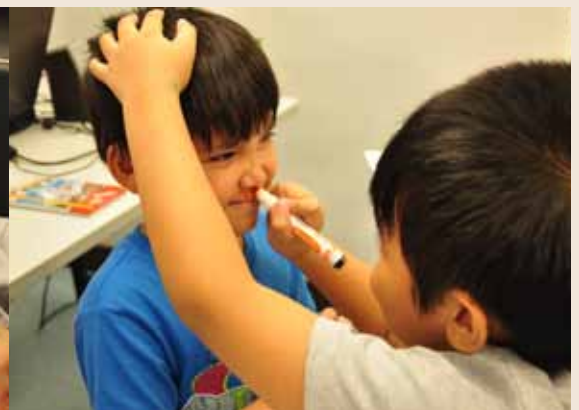
參加手工活動的孩子們