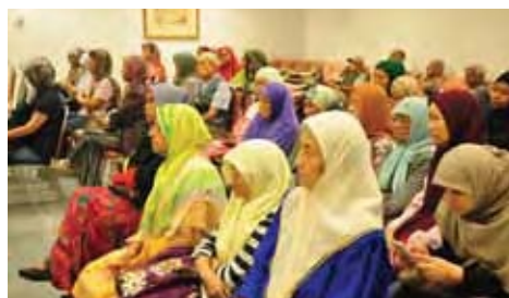
Brothers and sisters attending the Fatihah

Organised jointly by the Union's Da'wah and Welfare Committees, the function was held in the seminar room on the 6 floor of Masjid Ammar and Osman Ramju Sadick Islamic Centre and attracted more than 150 participants.