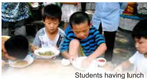
Students having lunch

The Union has sponsored a mosque in Shandong Province in East China to organise a summer course on Islam for children. More than 50 boys and girls aged between 6 and 15 years attended the month-long course.