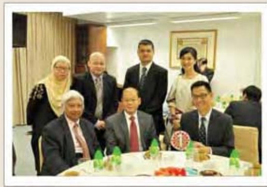
伊聯會主席，石輝兄弟（前排左一），香港警務處處長，曾偉雄先生（前排左二）與灣仔警區指揮官，李永光先生（前排右一）