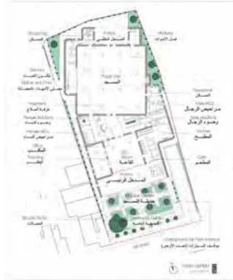
Plan of Cambridge Mosque

There are approximately 1,000 Muslim students and faculty members in Cambridge. To this number must be