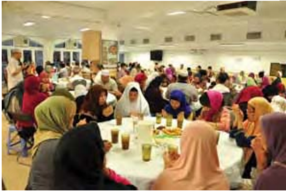
Iftar at 5/F Canteen

The Union, as in previous years, organised 'Iftar' meals to brothers and sisters who were fasting during the holy month of Ramadhan.