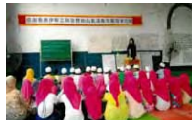
Students having class