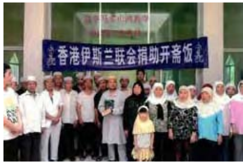
Iftar in Sichuan, China

In Henan Province, China, the Union remitted HK$ 31,600 for distribution to four masjids for iftar. A total of 91 men, 89 women, 15 children and 6 widows, while in Sichuan Province, a total of 910 Muslims comprising of 405 men and 302 women benefitted from HK$ 27,000 donation.