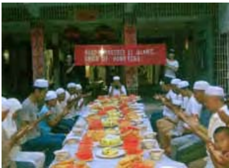
Iftar in Henan, China