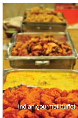
Indian gourmet buffet