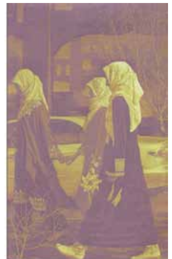
Xylographic Works of Luo Guirong