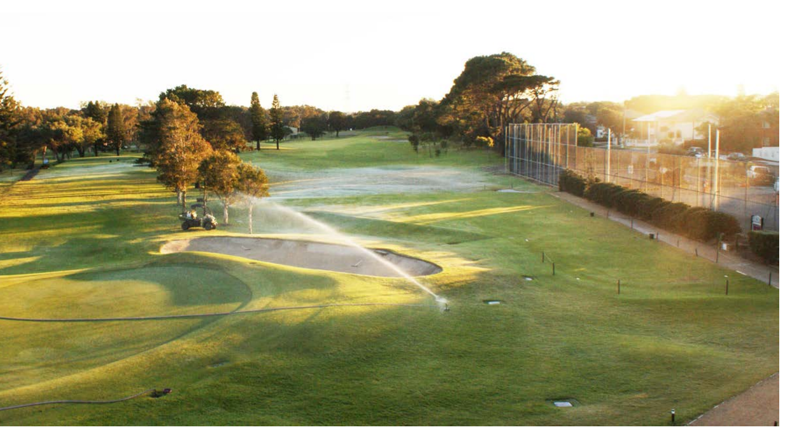
First frost - early July (a bit later than usual)