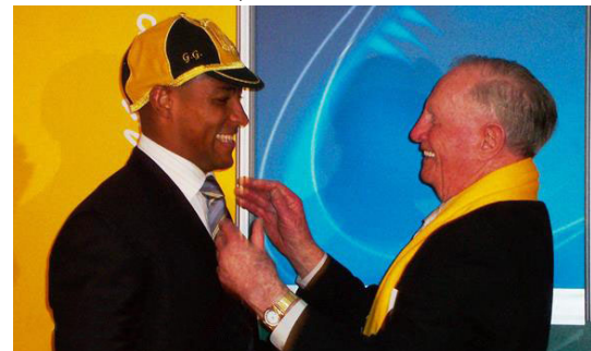
George Gregan's 100th test cap -Perth July 2004