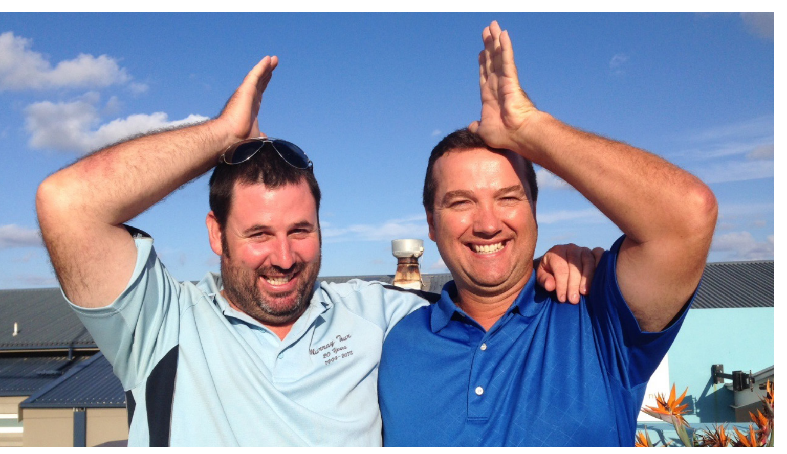
The Cock of the walk