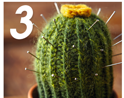
Gently tease out the mohair yarn to give a fluffy look to the tall cactus.