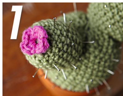
You can add more bobble shapes to make an even larger cactus!

Repeat these 2 rounds to create the moss