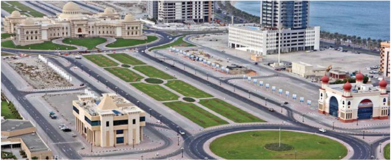
ITEC m.e. premises