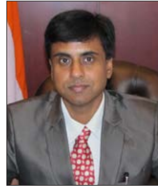
Consul General of India H.E. Shri. Anurag Bhushan