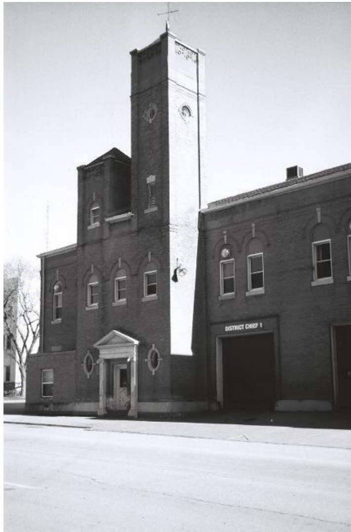
Detail view of the station's towers (west elevation.)

Address _____ 331 Scott Street _____ City _____ Davenport _____