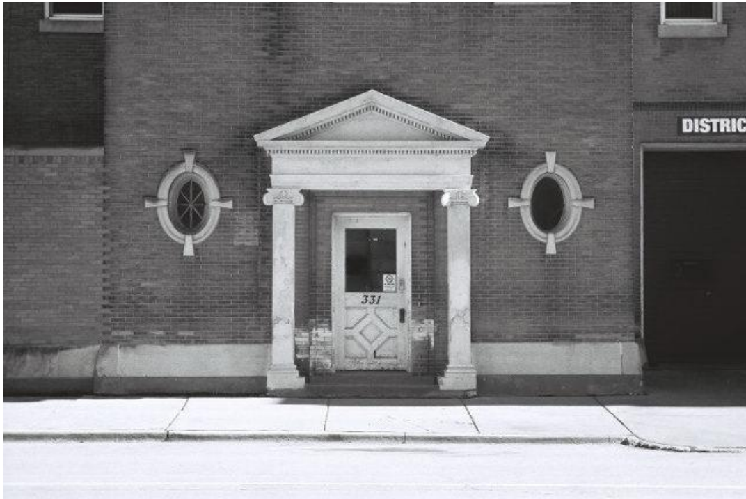
Detail view of the west pedestrian entrance. Note the use of classical elements including a pedimented entrance with Ionic columns.

Address _____ 331 Scott Street _____ City _____ Davenport _____