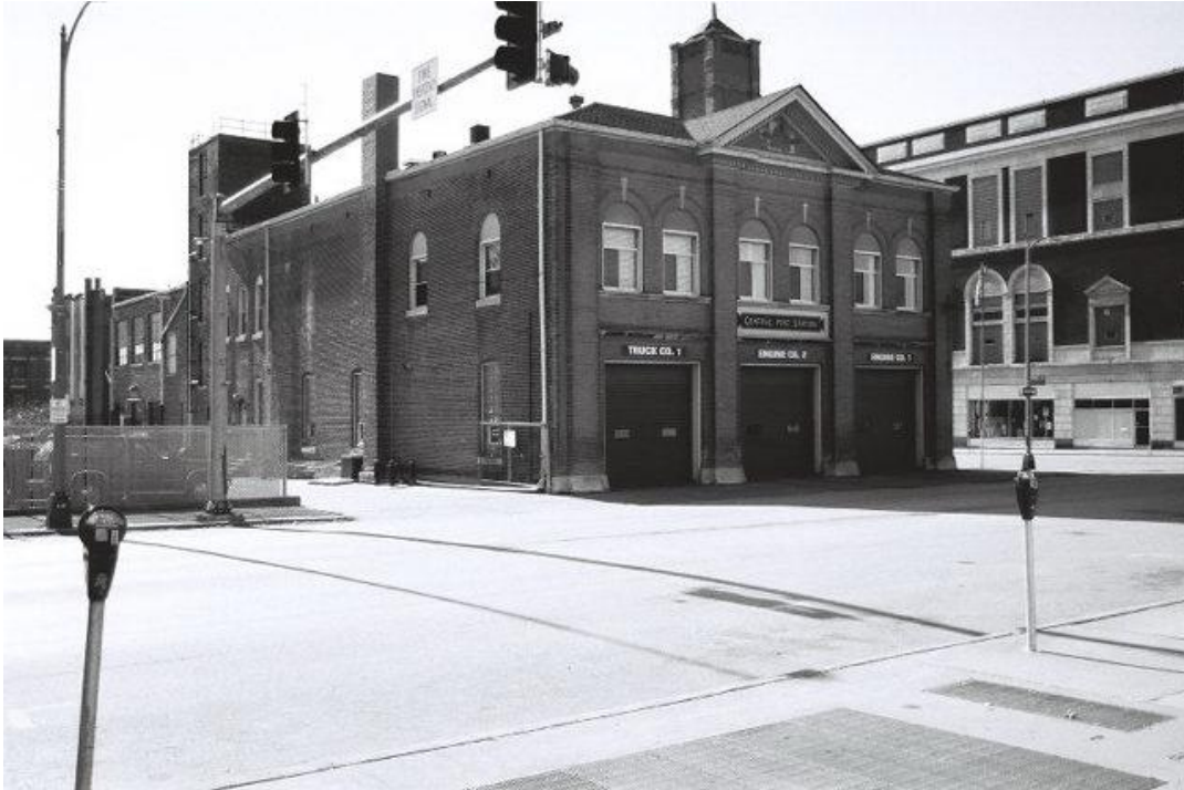
View of the north and east elevations, looking southwest across West Fourth Street.

Address _____ 331 Scott Street _____ City _____ Davenport _____