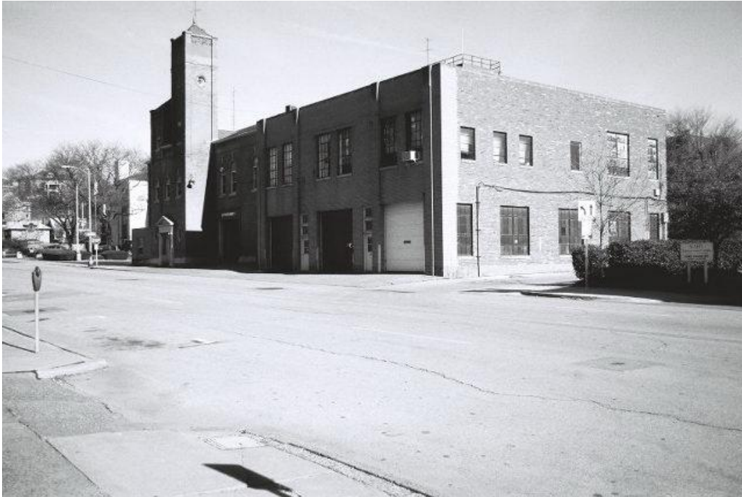
View of the west and south elevations, looking northeast across Scott Street. From this perspective, the three-bay addition to the rear is evident.

Address _____ 331 Scott Street _____ City _____ Davenport _____