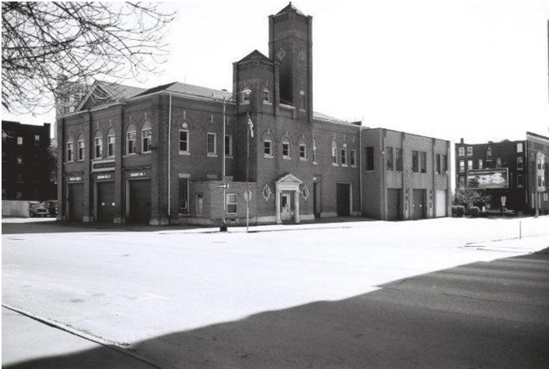
View of the north and west elevations, looking southeast across the intersection of West Fourth and Scott Streets.

Address _____ 331 Scott Street _____ City _____ Davenport _____