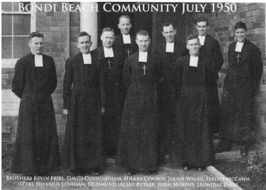
Marist Brothers' community, Bondi Beach, 1950