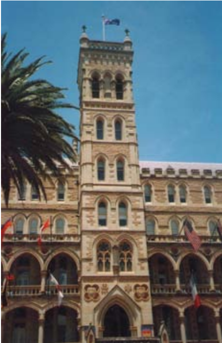
2. Tower and colonnades of Moran House.