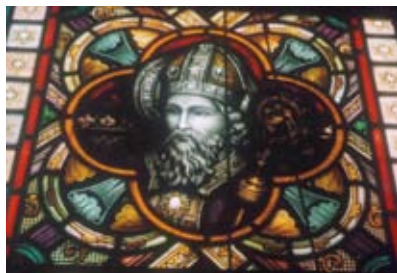
7. Above: Detail of St Kieran by Ashwin & Falconer, Cardinal's Palace.