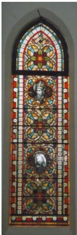
6. Left: St Kieran and St Canice by Ashwin & Falconer, Cardinal's Palace.