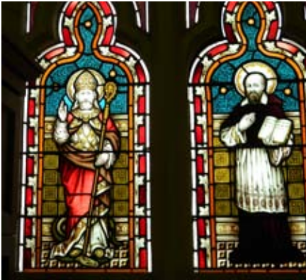
3. St Patrick and St Francis, and right: 4. Our Lady and St Joseph, both windows by Ashwin & Falconer, Moran House.

Stained glass by the sea: Cover image 1. Detail of St Bartholomew by John Hardman & Co., Cerretti Chapel.