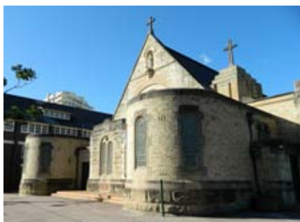
10 Church of Mary Immaculate and St Athanasius, Manly.