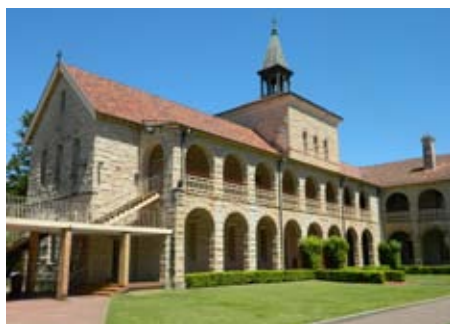
11. St Columba's High School , Springwood.