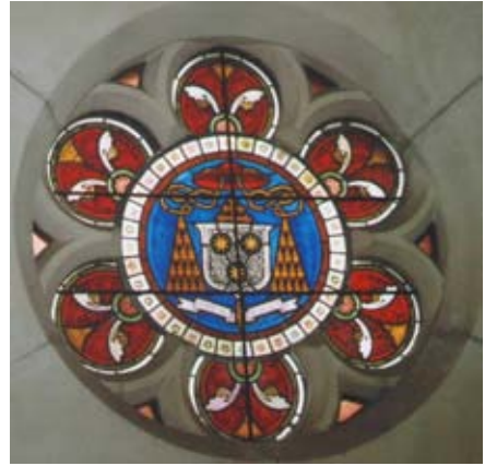
5. Cardinal Moran's arms by Ashwin & Falconer, Cardinal's Palace.

Stained glass by the sea: Cover image 1. Detail of St Bartholomew by John Hardman & Co., Cerretti Chapel.