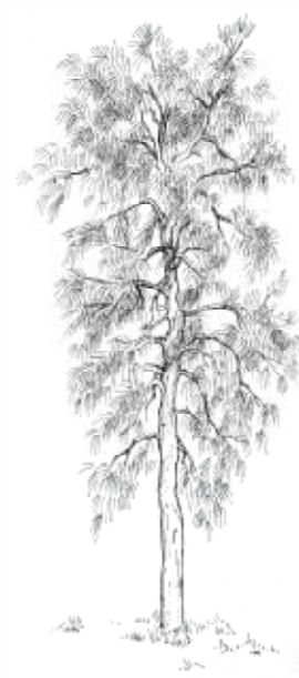
Peuce is a Greek word meaning pine