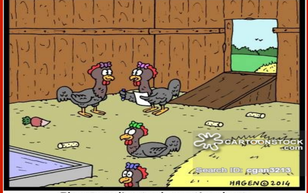
I'm struggling to do my timesheet: Do you remember if I laid an egg on Tuesday?