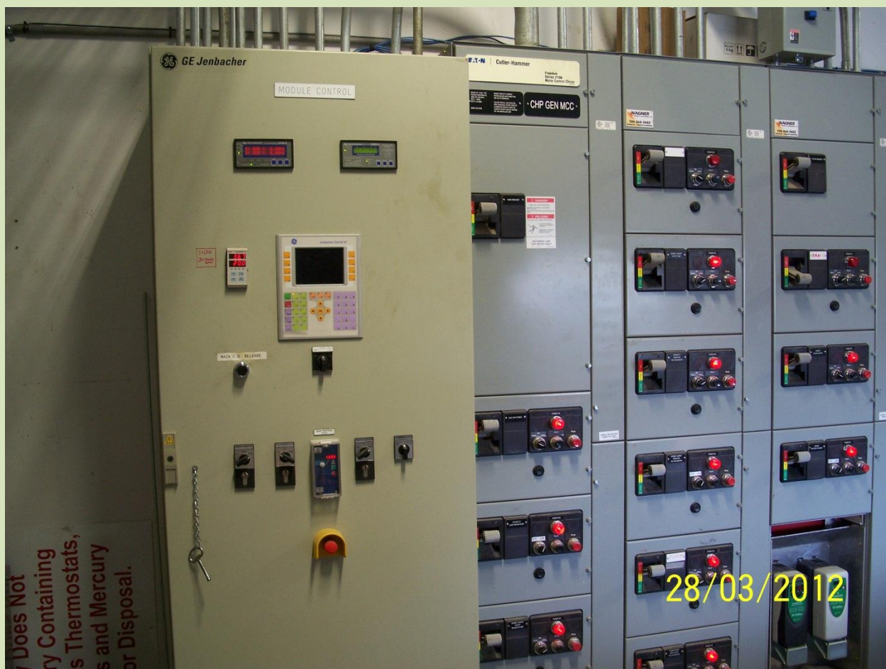
Photo Above: Combined Heat and Power (Methane or LFG Powered Generator) Control Panel

End Use Plans for the Seneca Landfill Gas Control Project include using the facility as a model for others in the Solid Waste Industry, or in Secondary and College Level Education programs, to provide a working, profitable, example of the application of state of the art technology in Utilization of Landfill Gas to preserve energy independence in our operations, locally and nationally. Seneca Valley High School is three miles south of Seneca Landfill and the opportunity to provide educational programs for environmentally sound solid waste management, power generation and conservation of resource through developing and applying state of the art technology to Seneca Landfill's Gas Utilization Project is an opportunity the owners of Seneca Landfill welcome.