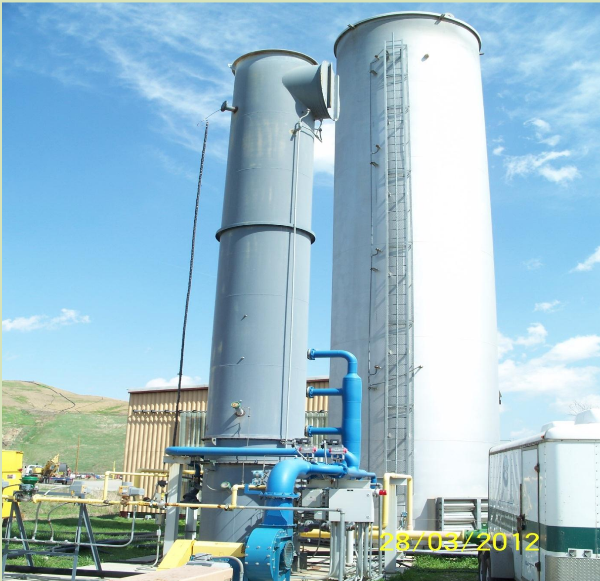
Thermal Oxidizer (Left) and Flare – Stack Testing