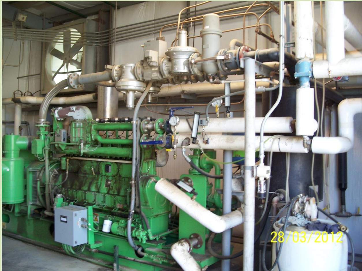
Photo: CHP Building showing Jenbacher Landfill Gas Generator with Heat Recovery Piping

LEGO-V design introduced an entire “New World” of LFG control requirements as well as the ability to produce pipeline quality methane gas which may be utilized for Seneca Landfill’s site energy needs with the balance sold. The state of the art Pressure Swing Absorption and multi-membrane gas separation technology is very sensitive to infiltration of Oxygen and Balance Gases such as Nitrogen. With the Flare LFG could be destroyed with up to 5% Oxygen. With the CHP technology the acceptable Oxygen level drops to 0.5%. With implementation of the LEGO-V Project the acceptable levels of “contaminant gases” further reduced. The LFG Control System was refined, the frequency of readings was increased, employees were trained to operate gas analytical equipment, HDPE pipe fabrication and repair equipment and to monitor and adjust the well field to maintain very tight parameters for the LEGO-V System and compliance with the Operating Permits. As with the CHP, the operational flexibility to use the flare remains. This option is rarely exercised as a LFG Control Device due to the environmental and economic benefit of the state of the art enhancements to the Seneca Landfill LFG Control Project.