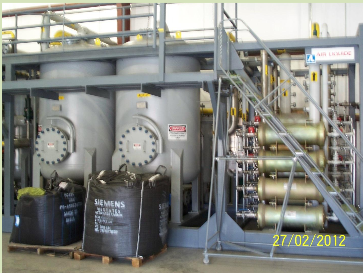
Photo Above: Air Liquide Gas Separator Membrane Skid – Right; PSA Beds on Left during carbon change maintenance. Note activated carbon staged for recharging PSA Beds in foreground.

gas thereby further improving the technology of the already “state of the art system” and improving the environmental and financial performance of this technology. This improvement contributes to further marketing of “state of the art” technology which serves to provide environment, solid waste industry and energy conservation benefits.