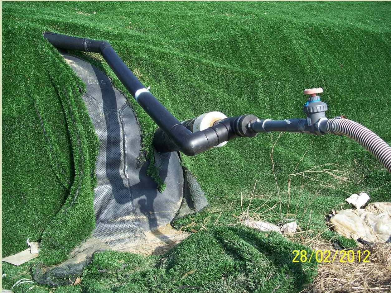
Photo Above: Landfill gas being collected from leachate piping clean out port in capped landfill area.

may further allow the option of switching from production of pipe line gas to additional electrical power generation to better serve the interests of the community and for enhanced financial performance of the Project. Upon completion of active landfill gas production the facilities and equipment may be dismantled and sold. The land area upon which they are constructed may then be put to use for other beneficial purposes by the owners.