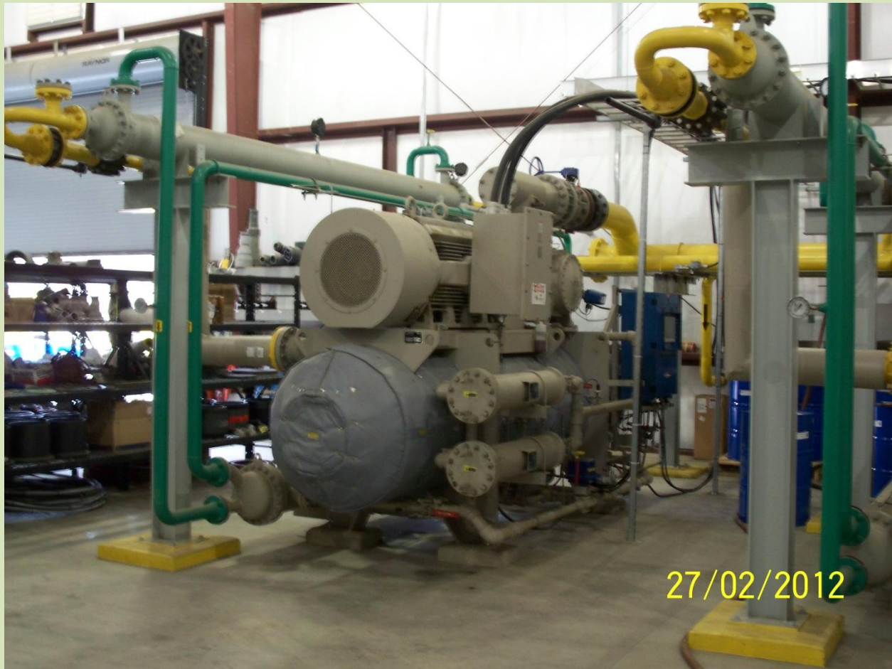
Above: One of Two 600 HP Compressors in the LEGO-V System

Following completion of the Combined Heat and Power Project, Seneca Landfill's owners promptly moved to the next phase of the overall Landfill Gas Control Project with the design and construction of the LEGO-V facility. LEGO-V is a "state of the art" Pressure Swing Absorption (PSA) gas separation process which separates landfill gas through membranes, under pressure. The membranes are supplied as a bank of individual membranes, by Air Liquide. (See Support Documents.) The design allows change out of individual membranes or application of the desired number of membranes for the quantity of gas available.