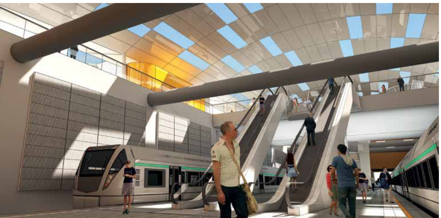
Concept image only of station

Consultation will be undertaken with the local community over the appearance, layout and features of the station.