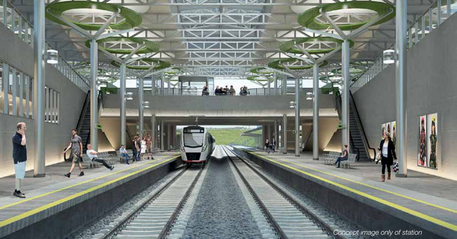
Concept image only of station