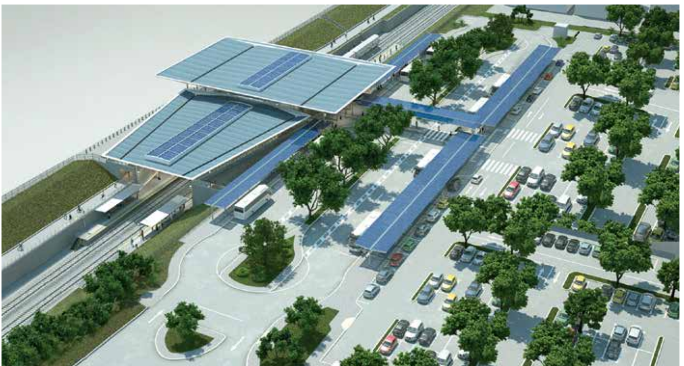
Concept image only of station

This station will serve residents of the eastern suburbs and the surrounding catchment area with a 20 minute rail journey time to the Perth CBD. It also will provide a possible future rail connection southwards.