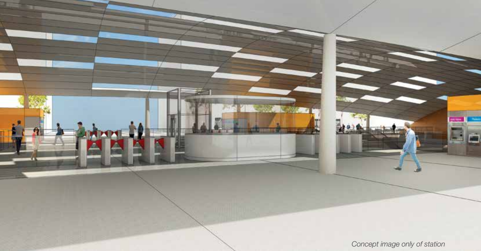
Concept image only of station