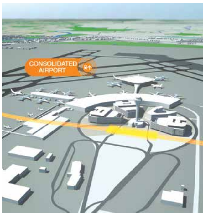
Indicative airport design by 2020

Accounting for future increased air passenger travel, the station will be located in the Airport Central precinct servicing both domestic and international passengers as well as airport and airline staff.