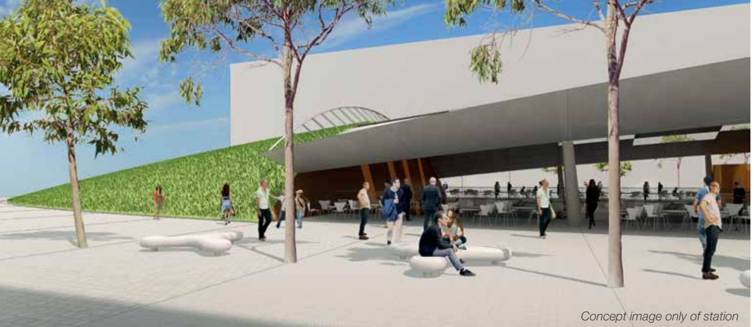
Concept image only of station