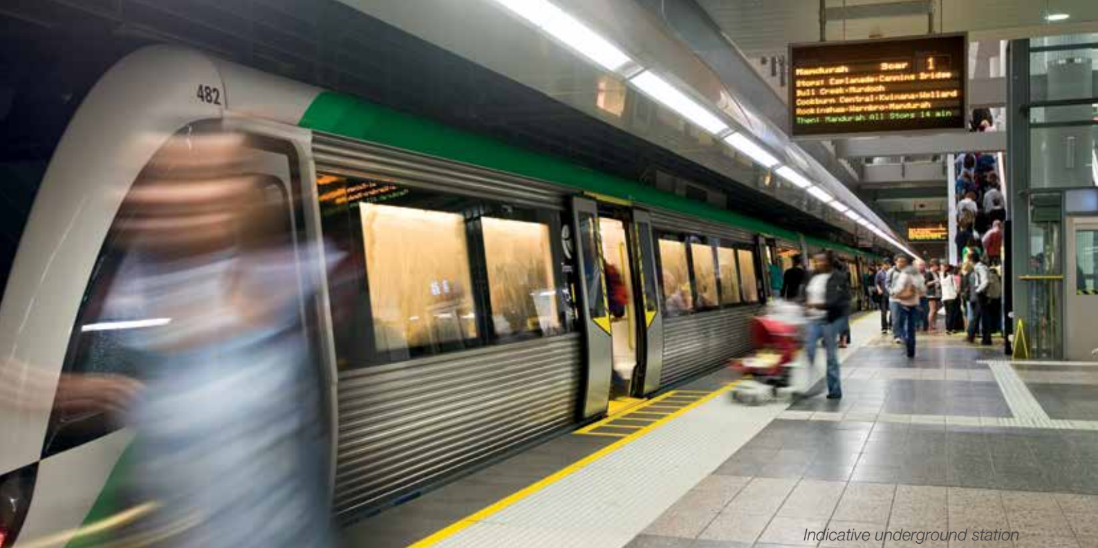
Indicative underground station